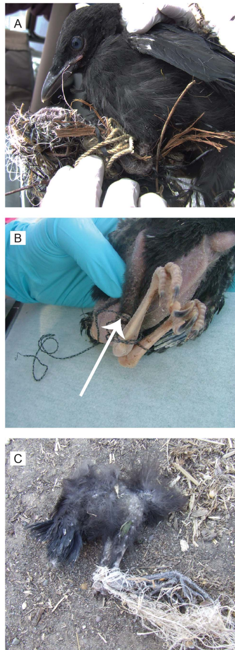
Figure 3. Nestling entanglement. (A) Nestling with tarsometatarsus entangled in mass of synthetic string; (B) nestling with legs tied together with wire (arrow indicates strictures in the bone of the tibiotarsus); and (C) carcass of nestling with legs tied together by synthetic string.

Anthropogenic material greater than 10 cm was detected in 85.2% (46/54) of dissected nests. Only three of 36 nests in primarily agricultural territories (8.3%) and five of 18 nests in urban territories (27.8%) contained no anthropogenic material. The mean total length of anthropogenic material in these 54 nests was 292.0 \pm 49.3 cm (range: 0–1858.3 cm). Material included synthetic string, twine, or rope; plastic tape; strips of plastic or cloth (including elastic, ribbon, gauze bandages, fabric straps, and unraveled woven sacks); fishing line, balloon string, unraveled nets, and wire mesh (Fig. 2). Amount of anthropogenic material in the nest varied with landscape: total length of anthropogenic material was significantly longer in nests in agricultural areas than in urban areas (mean total length agricultural = 363.70 \pm 68.04 cm; n = 36 nests; mean total length urban = 163.60 \pm 43.64 cm; n = 18 nests; \beta (urban) = -6.03 \pm 2.81 ; t ( -2.15 ); p = 0.04 ), and the longest piece of anthropogenic material was significantly longer, on average, in agricultural nests than in urban nests (mean longest piece agricultural = 64.30 \pm 8.23 cm; mean longest piece urban = 38.04 \pm 8.32 cm; \beta (urban) = -2.18 \pm 1.02 ; t ( -2.15 ); p = 0.04 ).