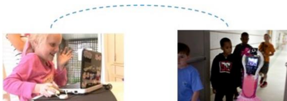
Figure 2: Child at home controlling robot at school

(i.e., the classroom/school) and have the freedom to move around as if s/he were physically there. The robotic unit has a screen to project the student's face, is mobile, and is remote controlled by the student—the student controls the robot from home, the hospital, or while traveling as long as there is wifi connectivity (Figure 2). After the robot is placed in the classroom and the homebound student logs onto the system, the student can see, hear, talk, interact, “raise a hand” (via flashing lights), and have access to any location in the classroom and school similar to that of a student in a wheelchair. The unit is recharged every night and provides a two-way, secure, real-time connection for the student that typically lasts most of the school day.