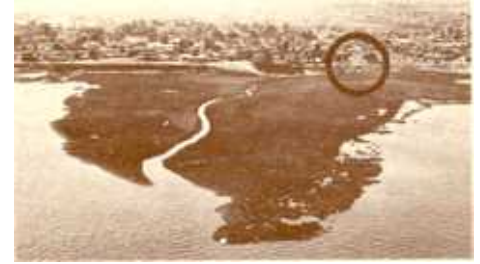
Mission Bay marsh in the City of San Diego. The location of the new lab is circled.