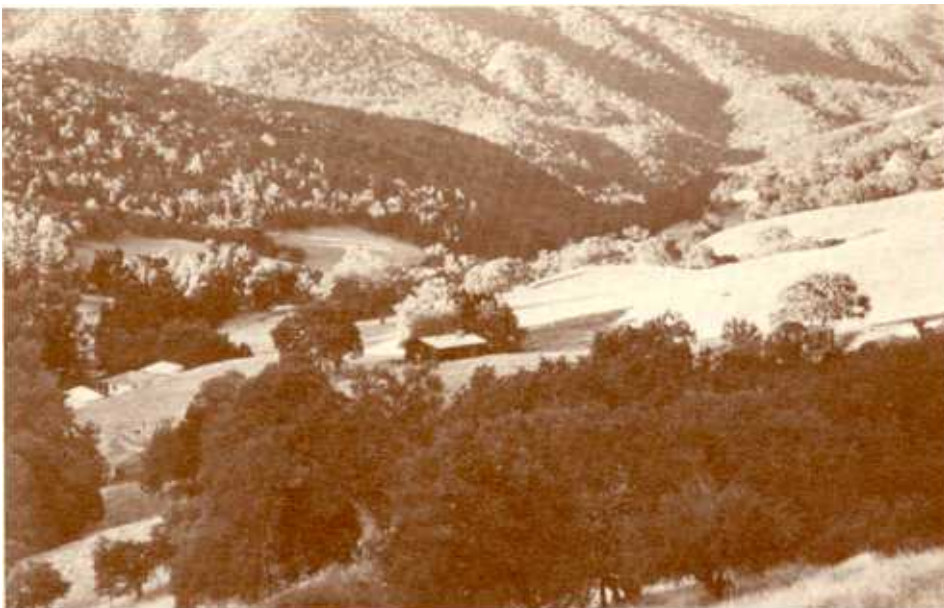
The Hastings Natural History Reservation looking south over the headquarters area.

Long-term studies such as this on acorn woodpeckers are relatively rare in science. They are eminently feasible at reserves in the Natural Land and Water Reserves System. The results of such studies expand our knowledge in new and unexpected ways. Certainly, comprehensive long-term studies of the acorn woodpecker have given new meaning to the phrase "free as a bird," and a fuller appreciation of the role limited resources play in the environment we share with our feathered friends.