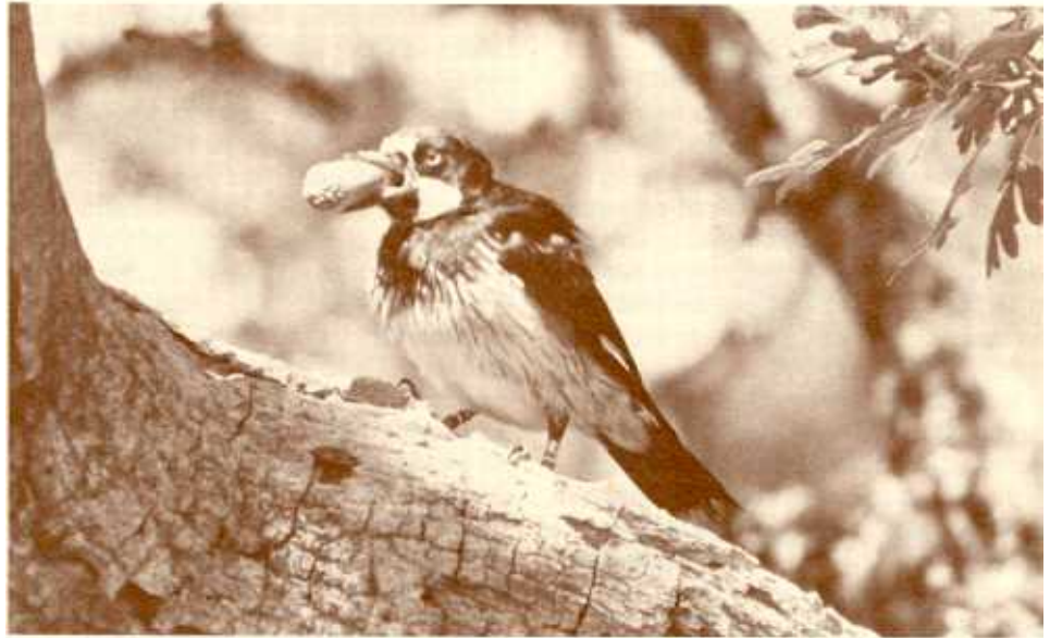
Studies of the eating habits of the acorn woodpecker, a common resident of oak habitats in California and the American southwest, have shown that animal societies can be structured to enhance the survival of a species.