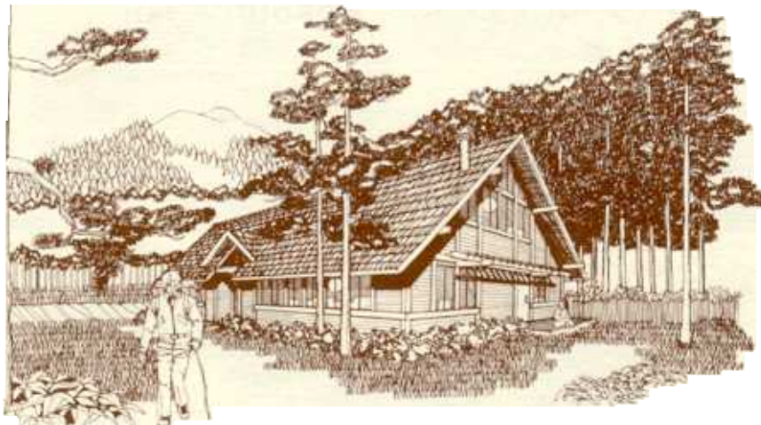
The new Trailfinders' Lodge at the James San Jacinto Mountains Reserve.