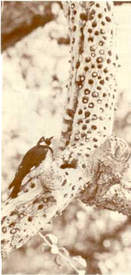
Acorn granaries are an important habitat component for acorn woodpeckers, providing critical food reserves for large communal breeding groups of this species.