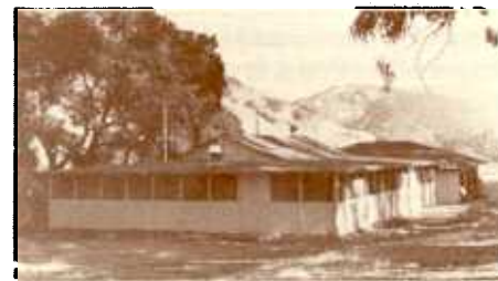
The Channel Islands Field Station looking towards the sleeping porch, on Santa Cruz Island.

will enable multi-day field classes to hike an elevational transect from sea level with its gray whales, sea otters and harbour seals to the 1,570-meter (5,155-foot) summit of Cone Peak in the adjacent Ventana wilderness with its forests of ponderosa pine, sugar pine, and rare Santa Lucia firs. Two former homesteads are being refurbished to provide primitive shelter and work space for long-term researchers.