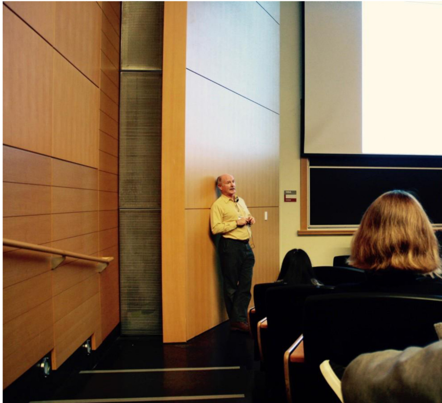
Rafael Yuste is a key figure in inspiring the White House to sponsor the BRAIN initiative