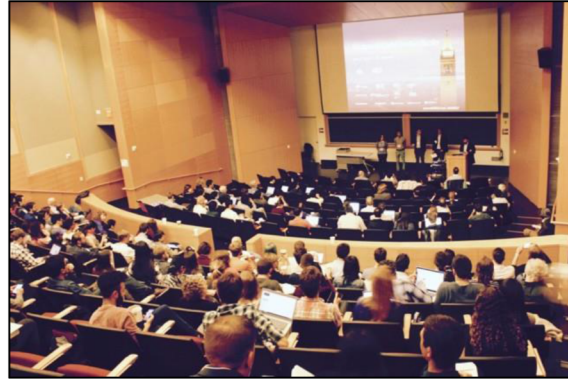
Stanley Hall is the venue for structured light in the brain, with a generously lit foyer

dimensions to stimulate consequent behavior and the ability to probe neural signal patterns for a given behavior. Once the neural patterns are known for particular behaviors, correlations between the stochastic, highly correlated neural networks and the emergent mind — logical but also unpredictable — will allow characterizing and engineering consciousness from its structural building blocks.