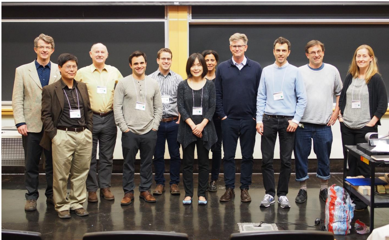
The SLB2017 speakers.