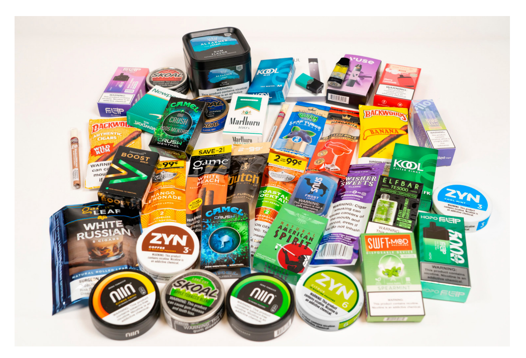
Figure ES.4 Examples of flavored tobacco products