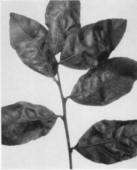
FIGURE 1. Leaves of Genoa lemon affected with lemon crinkly leaf virus.

house. The method of inoculation used for young seedlings has been previously described (3) and proved satisfactory, 100 per cent successful takes being usual. Ten seedlings of each variety or species to be tested were inoculated in each series.