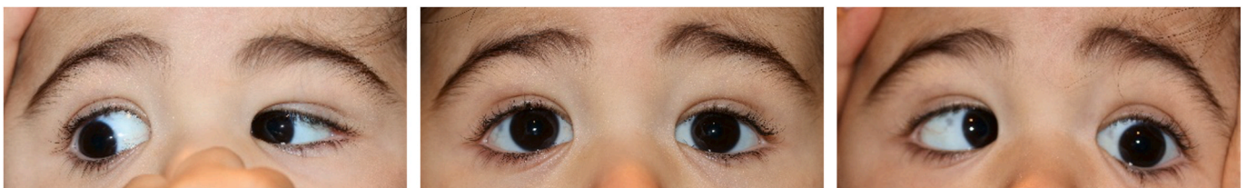
Fig. 1. External ocular motility photographs demonstrating a marked limitation of abduction of the left eye. Adduction was full but was associated with mild globe retraction in the left eye. Ocular motility was full in the right eye. These findings are consistent with the diagnosis of Type 1 Duane Retraction Syndrome (DRS).

The authors declare that they have no known competing financial