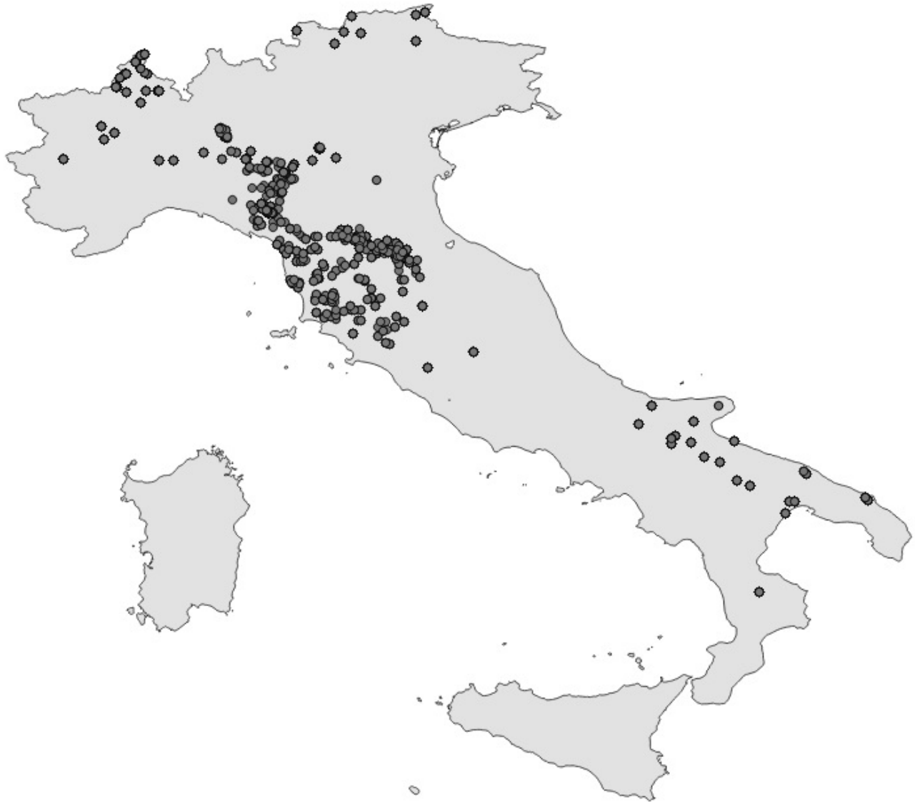
FIGURE 1. Sampling sites distributed along the Italian peninsula.