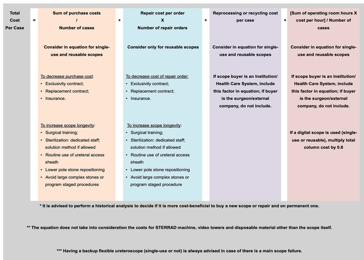
Figure 3 - Literature-based equation to allow a cost-analysis decision model to flexible ureteroscope acquisition.

gle-use devices in hands-on courses and residency training. Finally, no instrument is failure-proof and a back-up device, single-use or not, should always be available in case a second scope is required to finish the case.