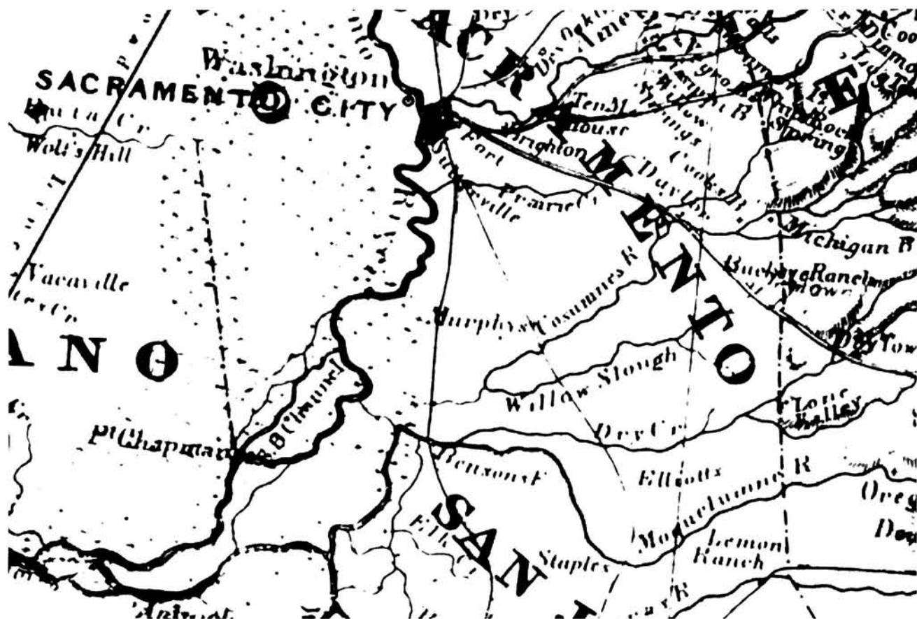
Figure 2. 1854 Map showing Benson's Ferry crossing the Mokelumne River near Dry Creek (Preston 1974:21).

Fresno, and the others in the northern districts. These reservations to be military posts. In fact, he proposes to establish military pueblos, somewhat similar to those in New Mexico; or a system in some sense the same as that which has hitherto prevailed in this State at the missions, the difference being in the nature of [lengthy blank section] agricultural knowledge—that they are most apt scholars—and that they might be made very useful laborers. These reservations, Lieut. Beale thinks, would produce enough corn, by means of Indian labor, to feed the army of the United States and to spare. A band of the Mariposa Indians is already employed in the cultivation of the soil, thanks to the agent's industry [ SJR , 15 January 1853].