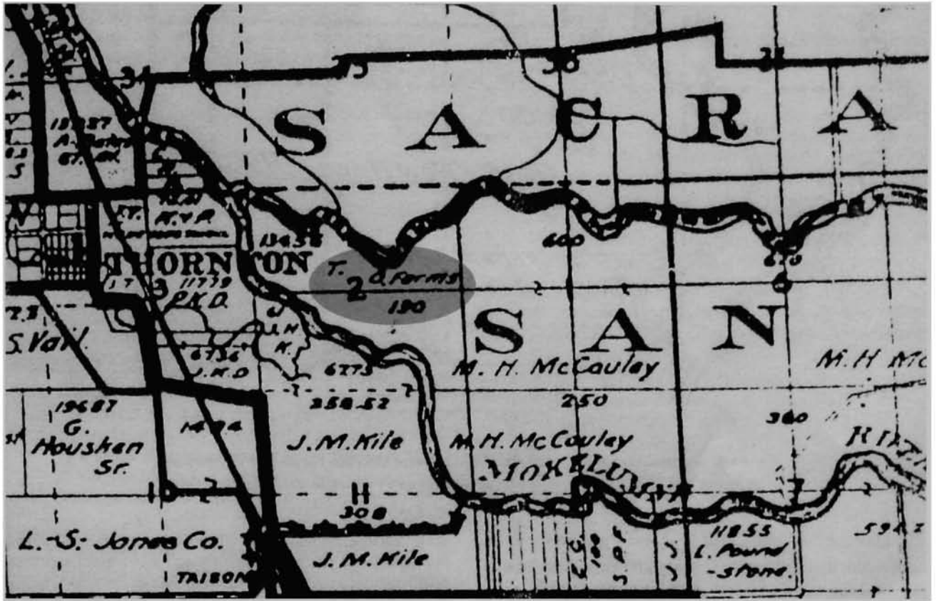
Figure 3. San Joaquin County Map showing T.O. (Thornton Orchards) Farms in 1926 (Budd and Widdows 1926).

Dry Creek and directly south of the old Slater property (Fig. 4).