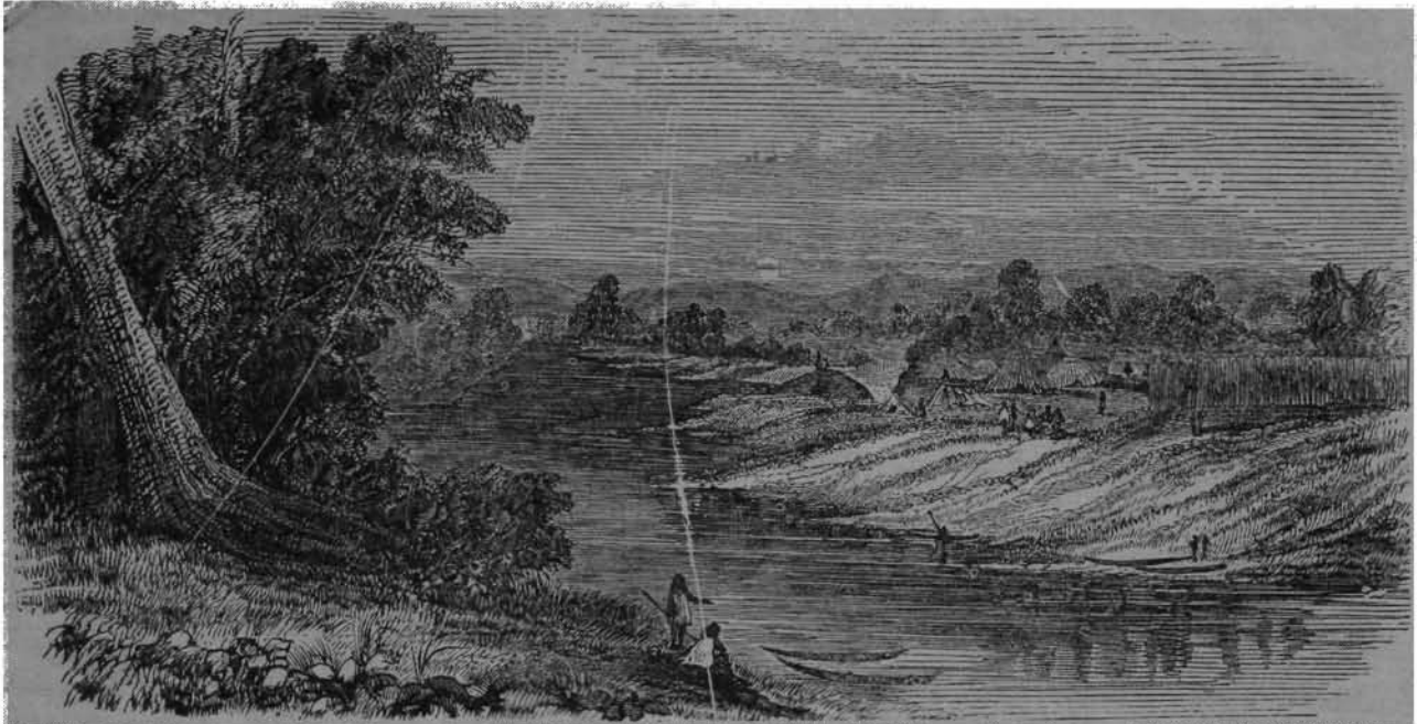
INDIAN RANHERIE ON DRY CREEK.