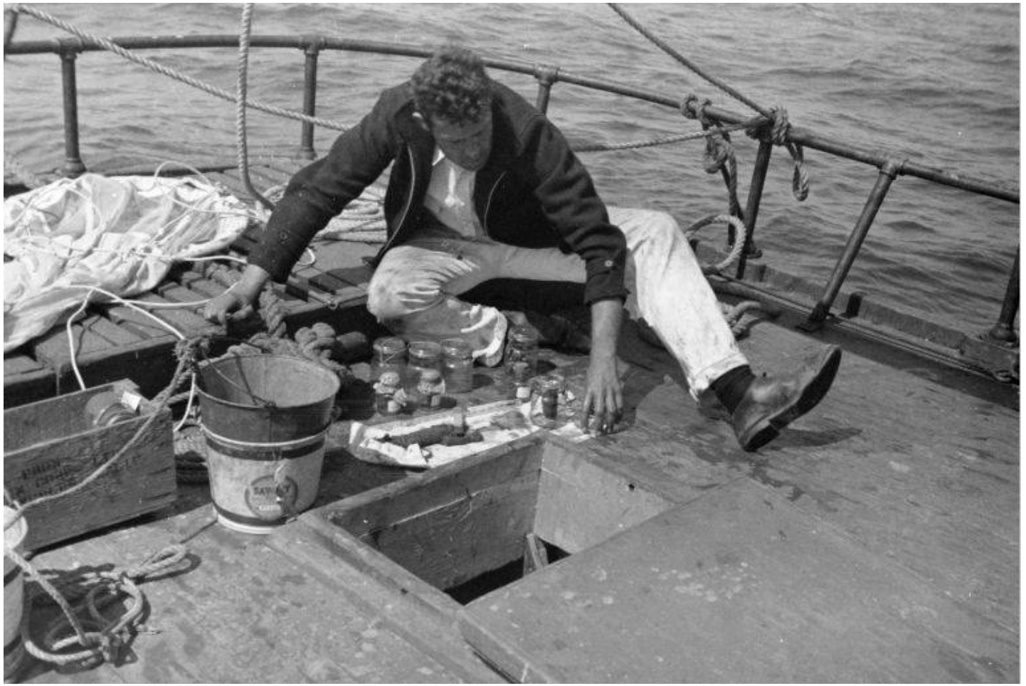
Roger Revelle on deck of E.W. SCRIPPS with specimens, 1936