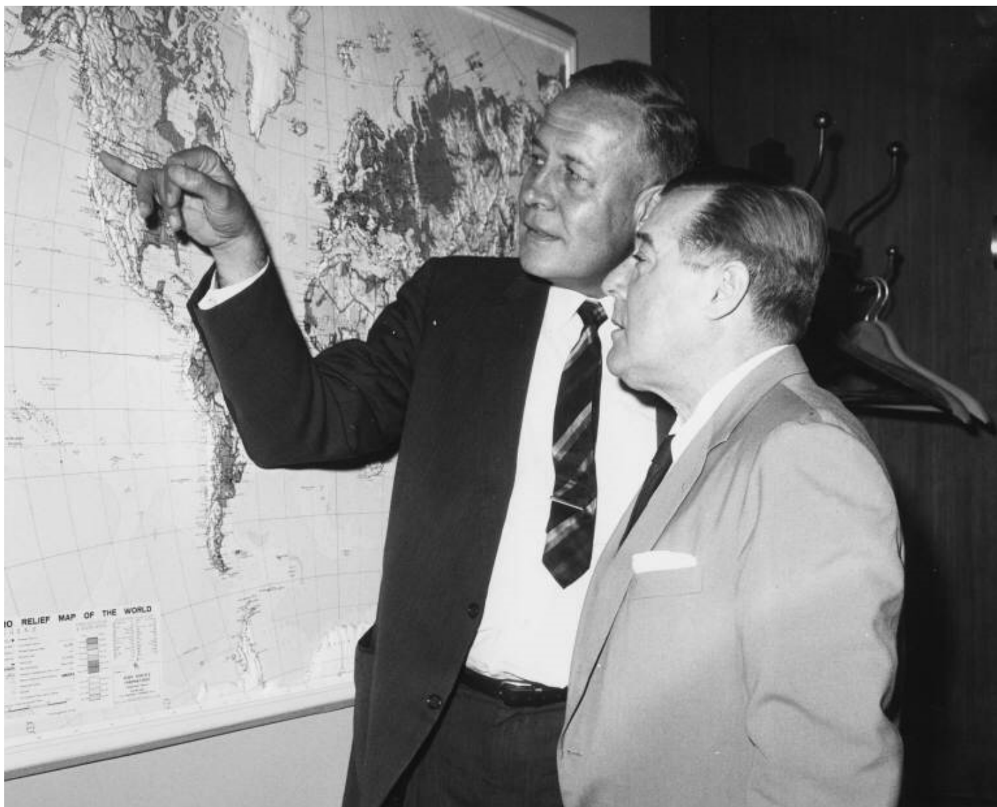
Roger Revelle and United States Senator Warren G. Magnuson, during Revelle's testimony before the Senate committee on Interstate and Foreign Commerce, 16 March 1961