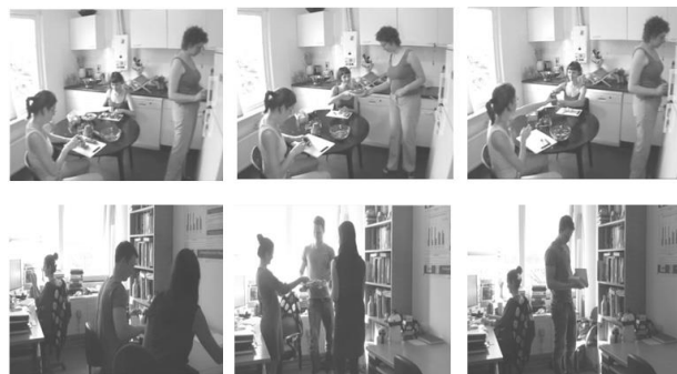
Figure 1: Stills from the stimulus videos featuring kitchen (upper row) and office activities (bottom row)

We used two short silent videos (cf. Azar, Backus & Özyürek, 2016) to elicit narratives. Three characters were engaged in joint activities; cooking in one video and office work in the other. Figure 1 illustrates stills from each video.