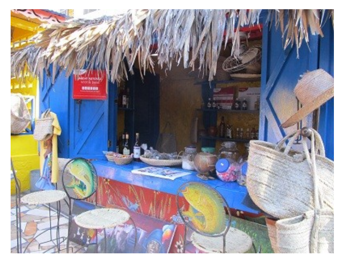
Figure 8: La Coquille, a restaurant offering TchoTcho Mobile.

One important challenge with mobile money outlets is the provision of a reliable, functioning service. Outlets should not often face technical problems of their own making, because all they have to do is keep their mobile phone charged. It is up to the mobile money provider (the telecommunications company) to ensure that the