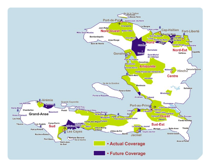
Figure 12: Voilá coverage map.

When thinking about providing financial services for the poor, there are a few issues to consider. Mobile money may be accessible for people who do not have mobile coverage but who make frequent trips to areas that do have a signal. The limitation of mobile money is that transactions can only be done where there is a mobile phone signal. Electricity is a problem to a lesser extent, because mobile towers can be powered either by the grid or by generator. In many rural areas people who do not have electricity at home will pay to recharge their phone at a small kiosks powered by solar panels or batteries; others use a car cigarette lighter.