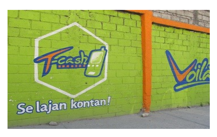
Figure 5: T-Cash sign painted on a wall in Pétionville.

Because registration for the T-cash mini-wallet can be done over the phone, it is a promising way to encourage people to register for mobile money. Having a mini-wallet gives customers a chance to become accustomed to the service, and they can later register for a larger wallet if they find that the service suits their needs.