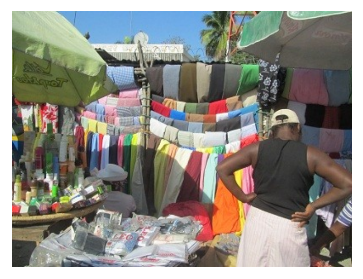
Figure 15: Goods for sale in a street-side stall.

normalize it as an economic tool rather than a 'product for the poor'. [19]