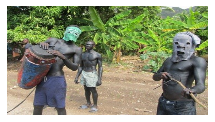
Figure 17: Teenagers in Jacmel collecting donations for their Carnival band.