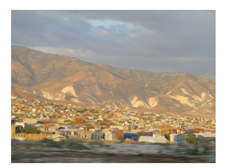
Figure 2: A camp of earthquake-displaced people north of Port-au-Prince.

We explain in detail the current state of mobile money in Haiti, the advantages of the services and products that TchoTcho Mobile and T-Cash provide, and the challenges of using mobile money services at a variety of levels we have observed at multiple levels as it continues to emerge and evolve. Our aim is to document this dynamic landscape and, where appropriate, make recommendations for how to improve mobile banking in Haiti and suggest creative ways that it can be applied to the needs of individuals, enterprises, non-profit organizations, and government.