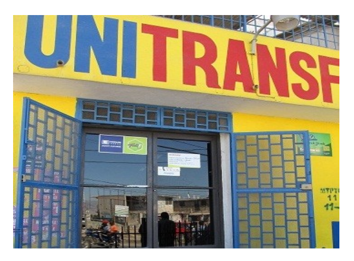
Figure 9: T-Cash outlet in a Unitransfer office.

may affect the success of some outlets. As mobile money providers expand their agent networks in Haiti, they should be aware that while business owners have an incentive to become mobile money agents because of the commission and the added traffic that mobile money brings, the way they set up service provision will affect customer experience and return business.