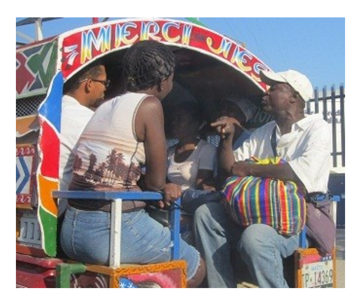
Figure 16: Taptap transport.

We are optimistic about mobile money's future in Haiti and believe that this is a promising opportunity to achieve both commercial profits and socioeconomic development goals. Whether an alternative to Haiti's underdeveloped banking system, a backup in case of emergencies, a way to store money for personal use, a trading tool or a means to redistribute international remittances, mobile money has a broad range of potential applications in Haiti. Maximizing mobile money's promises will require ongoing dedication, creativity and cooperation between players in the private and public sectors, especially taking into consideration emerging uses of mobile money among different sectors of the Haitian population.