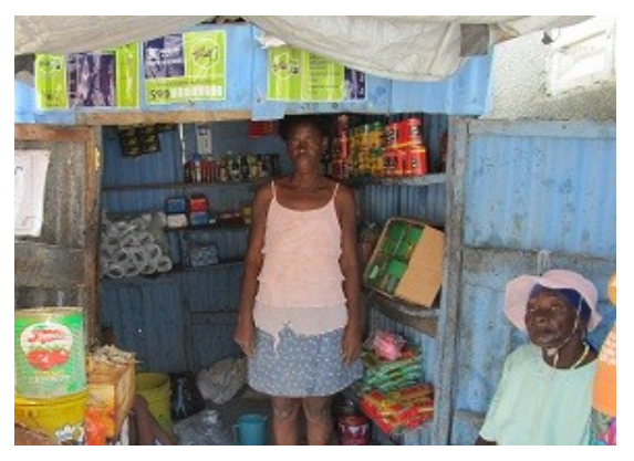
Figure 4: A small store distributing food aid using T-Cash.

Mercy Corps and Voilá have ongoing plans for Saint Marc. In April and May, Mercy Corps and the Red Cross will run a market once per week in which 2,500 of the current recipients will be given a one-off payment of US$250 to spend on materials to build or renovate their homes, or to pay school fees (including technical/trade school). Later on, half of these recipients will be selected for a third time to spend a further US$250 on tools for small enterprises.