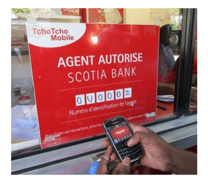
Figure 1: Depositing money in a TchoTcho Mobile account in downtown Port-au-Prince.