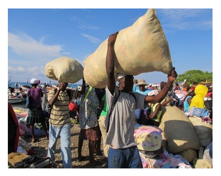
Figure 13: Trading used clothing in Marigot's market.

It is worth keeping in mind that the Haitian diaspora is a major source of income for Haiti. In 2008, international remittances to Haiti totalled $1.3 billion, making up 18.7% of the GDP. [18] While the diaspora cannot send money to Haiti using mobile money services, recipients of international remittances tend to redistribute funds on to other family members and may prove to be an important sector of mobile money users.