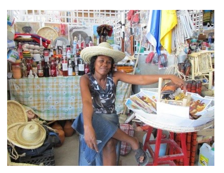
Figure 14: A voodoo stall in the Marche en Fer, Port-au-Prince.