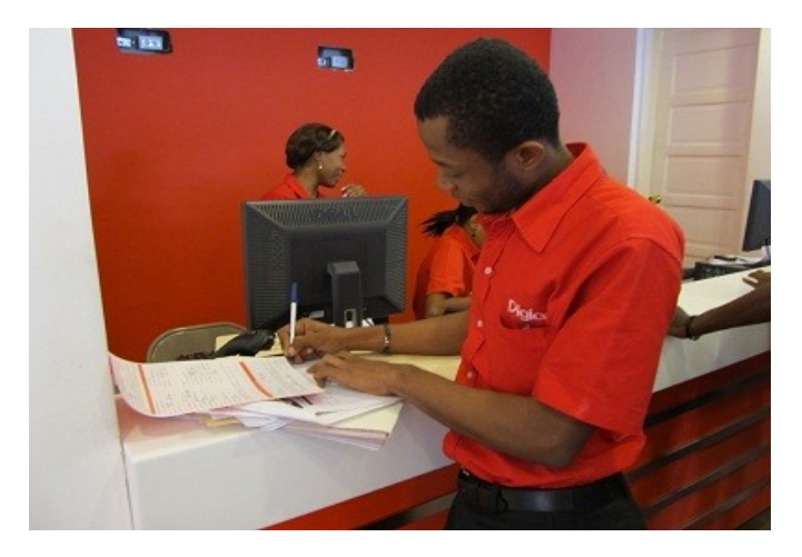
Figure 6: Registering a new customer for TchoTcho Mobile.