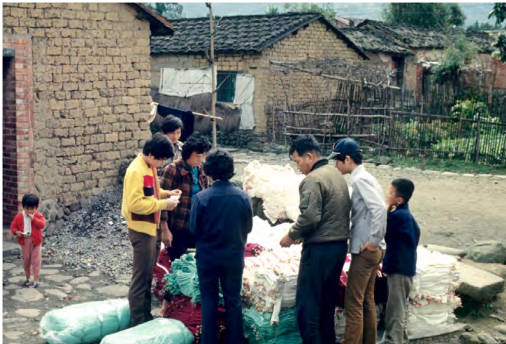
Figure 5. Bendi woman negotiating payment with factory representatives, 1973. The woman facing the camera is a proprietor, with her husband (not pictured), of a small-scale knitting mill (between two and four hand-operated machines) in Ploughshare village, in northern Taiwan. She is negotiating with putting-out factory representatives for payment for the piecework stacked on the ground.

household, where non-kin or extended family might board (Hsiung 1996, 131–132). Women workers were hardly docile (cf. Simon 2005, 109). They learned to “wrangle”—use barbed conversation, sometimes cooperatively, to improve their pay, resist exploitative requests, or embarrass the boss (Hsiung 1996, 134–35). Difficult work conditions contributed to women’s outspokenness and, in a favorable labor market, they were sometimes willing to risk being fired (Gallin 1989, 380; cf. Kung 1976, 48). These kinds of social-engagement skills, learned in wage labor, are at least marginally cosmopolitan in their own right because they require sufficient cooperation to result in a marketable product. In addition, these engagements set up a potential for greater cosmopolitanism if workers use these skills elsewhere.