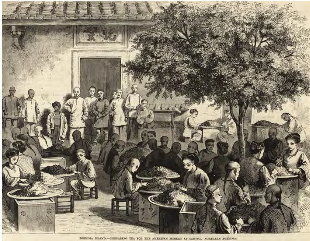
Figure 4. Bendi women and men sorting tea (1871). This illustration for a Western newspaper shows Bendi men and women sorting tea in an outdoor common public space in Danshui (Tam-sui). Some women are sitting alone, some with other women, and some with men. One man, with his shirt open and a turban, may be Austronesian.

implications for not only household economics and power dynamics but also communitarian cosmopolitanism. Japanese-period demographic records show that almost all Han women in towns (91 percent) and rural areas (98 percent) of Taiwan married, but in Taipei city almost 23 percent of women never married (A. Wolf and Gates 2005, 119). This significantly lower marriage rate may be due to urban life generally (A. Wolf and Gates 2005, 125, 128), but not all urban wage labor brought women into common public spaces with the same frequency.