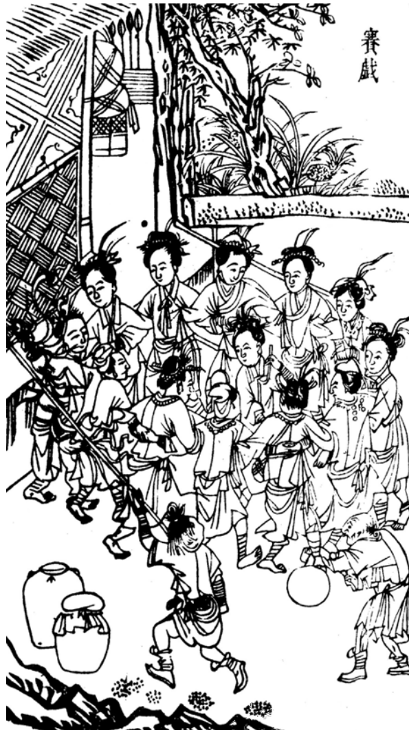
Figure 2. Woodblock print of plains Aborigine women dancing in an outdoor common public space for a festival.

The network of marital ties in Dutch Taiwan had implications for access to resources and implementation of policies. Many Han middlemen had plains Aborigine wives. These middlemen purchased from not only Austronesians but also any Han agriculturalists living in their licensed territories, many of whom also had Austronesian wives. Moreover,