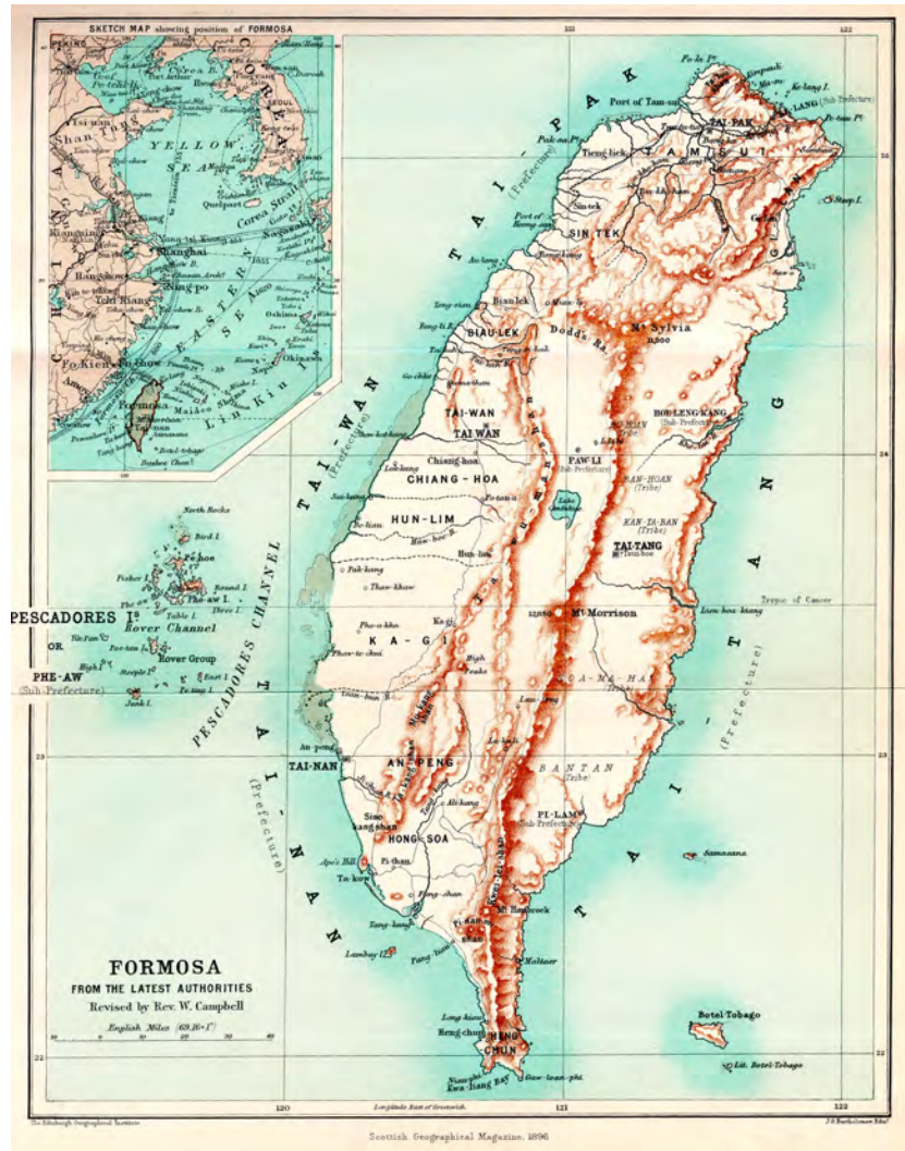
Figure 3. Map of Taiwan (1896). Place names are written using the Presbyterian Church romanization of Minnan; here, I provide the Mandarin pinyin romanization, as used in the article, with the map romanization in parentheses. The inset map shows Taiwan in relation to the Japanese archipelago, notably the port of Nagasaki 長崎; to the Chinese mainland, notably the province of Fujian 福建 (Fo-kien) and its ports of Fuzhou 福州 (Fu-chow) and Xiamen 廈門 (Amoy); and to the peninsula of Korea (Corea). The main map shows, on the western coast, from south to central: Gaoxiong 高雄 (Ta-kow), Tainan 臺南 (Tai-nan), Anping 安平 (An-peng), Lugang (Lok-kang; once Favorlang), and Zhanghua (Chiang-hoa). On the northern tip of the island, from west to east, are Danshui 淡水 (Tam-sui), Dadaocheng 大稻埕 (Twa-tu-tia), Mengjia 艋舺 (Bang-ka), Taipei 臺北 (Tai-pak), and Jilong 基隆 (Ke-lung).