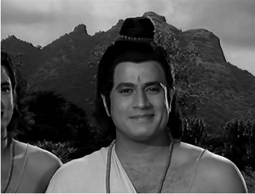
Figure 2. Rama gracing the screen with his mystical smile in Ramanand Sagar's TV Ramayana (1989).

on the unreal grounds of dream kitsch. They give again a possible life to the revolutionary energies that once inhabited outmoded forms. Like Benjamin's surrealists, they "bring the immense forces of 'atmosphere' concealed in these [mournful] things to the point of explosion. What form do you suppose a life would take that was determined at a decisive moment precisely by the street song last on everyone's lips?" 68 What form of life by the tableau last seen by everyone reflecting how, though empty, "they are in some sort sufficient to themselves"? 69 And so on for all the other senses and capacities.