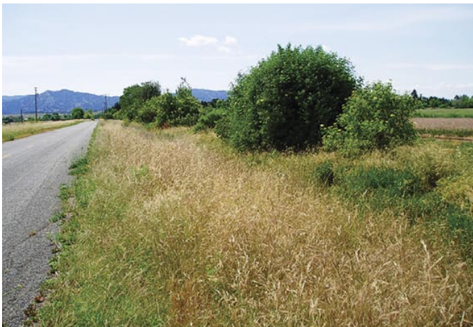
At relatively undisturbed site 1 (looking west), vegetation from the road edge (left) to swale (bottom right to center) is dominated by the native perennial purple needlegrass. The swale is periodically inundated in winter and contains a few individuals of the native perennial meadow barley distributed among a dense cover of common vetch ( Vicia sativa ), an invasive annual.

California annual exotic grasslands are largely composed of the species Italian ryegrass ( Lolium multiflorum Lam.), soft chess ( Bromus hordeaceus L.), ripgut grass ( Bromus diandrus Roth), wild oat ( Avena fatua L.), medusa-head ( Taeniatherum caput-medusae [L.] Nevski) and foxtail barley ( Hordeum murinum L.). Yellow starthistle ( Centaurea solstitialis L.) and broadleaf filaree ( Erodium botrys [Cav.] Bertol.) form a large component of the associated invasive annual broadleaf biomass (Heady et al. 1992; Lulow 2004; Pitcairn et al. 2006). Except for yellow starthistle, all of these invasive species complete their life cycles by the time soils become dry in the summer