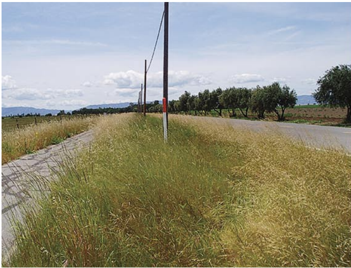
Relatively undisturbed site 9 (looking west) is bordered by a bike path (left) and road (right). Dense strips of the native perennial purple needlegrass (straw-colored inflorescences) are on the backslope (left) and shoulder (right of the phone poles), and a dense strip of the surrounding native perennial creeping wildrye (dark green) is in the swale (surrounding the phone poles).