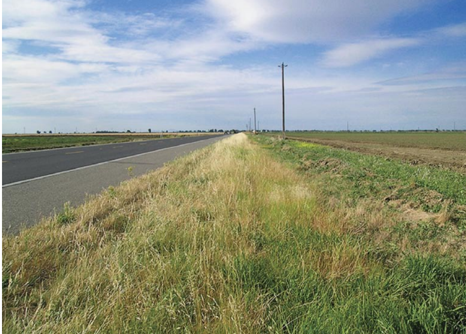
A dense strip of invasive species dominates the road edge (bottom left to center) of site 5 (looking north). The shoulder (bottom center to center) contains the native perennial purple needlegrass intermixed with Italian ryegrass and soft chess, invasive annual species. The swale and backslope (bottom right to center) have been disked (far right). The swale is periodically inundated by irrigation runoff in summer. Heavy disturbance in the swale and backslope has resulted in dominance by the invasives field bindweed, summer mustard ( Hirschfeldia incana ) and wild radish ( Raphanus sativus ).

tween sites was grouped by condition according to topographic zone (table 5). Due to critically low replicates in some groups ( n < 3 ; see table 3), no statistical tests could be run using this data set, but strong trends were evident through comparison of the means.