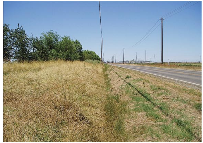
Vegetation cover on the road edge and shoulder (bottom right to center) of site 3 (looking north) is low. Low mowing on the shoulder has resulted in a monoculture stand of Bermuda grass ( Cynodon dactylon ), an invasive perennial. The narrow swale (bottom center to center) is dominated by Italian ryegrass, an invasive annual. Vegetation on the backslope (bottom left to center) is dominated by the native perennial purple needlegrass, with some invasive annual common vetch.

chose to seed native broadleaf species into their native plantings. Those species included yarrow ( Achillea millefolium ), California poppy ( Eschscholzia californica ), gumplant ( Grindelia camporum ) and lupine ( Lupinus sp.), which were seeded at unknown rates.