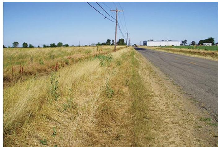
The road edge of heavily traveled site 4 (looking east) is bare (bottom right to center). A dense strip of stunted, invasive annual grasses (Italian ryegrass and foxtail barley) occurs to the left of the road edge on the shoulder (bottom center to center). A strip of the native perennial purple needlegrass occurs on the much-less-disturbed backslope (bottom left to center).