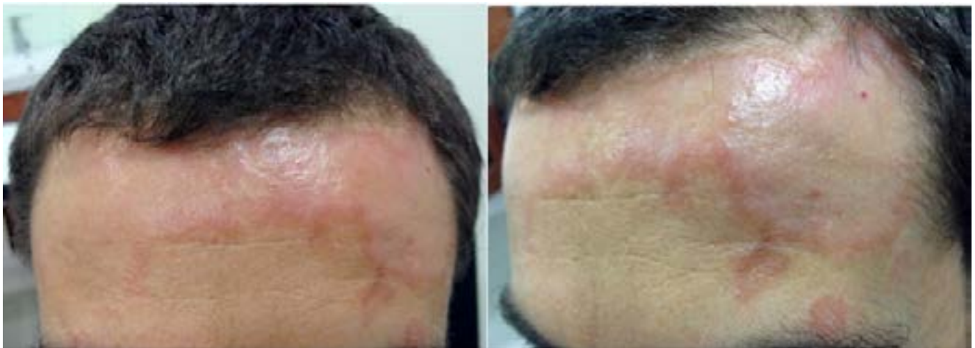
Figure 1. Clinical aspect of the lesions - frontal arciform erythematous plaque, with central atrophy.

Dermatologic examination revealed an arciform erythematous plaque with sharply demarcated