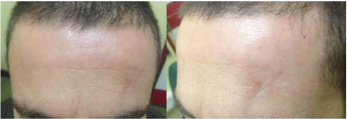
Figure 4. Clinical aspect after treatment.

Although our patient had a low phototype (type II) and resided in a sunny country, which can be regarded as two risk factors in the pathogenesis of the disease, no history of chronic outdoor activities was present. The authors question whether the chronic exposure to computer screens could have played some role in the etiology of our patient's disease [5].