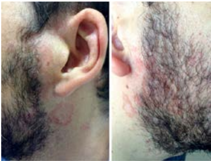
Figure 2. Clinical aspect of the lesions: lateral cervical annular erythematous plaques.

elevated borders, measuring 16cm x 5cm and occupying the upper half of the frontal region ( Figure 1 ). The center of the lesion exhibited clearing with slightly atrophic skin. The lesions were non-scaling and symptoms such as itching, tenderness, or pain were absent.