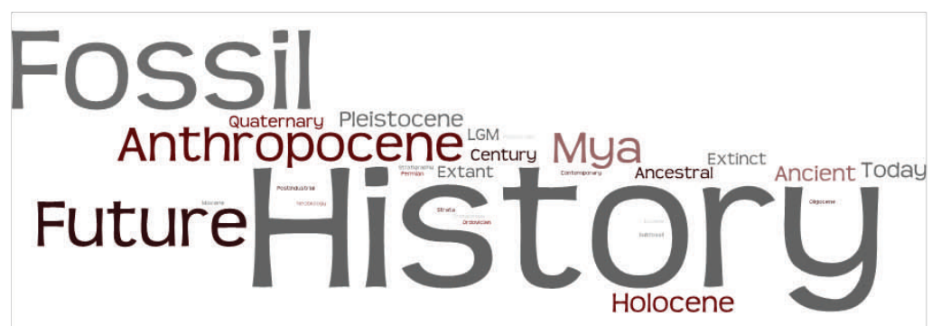
Figure 4. Terms related to time used at the 6 th IBS conference. Analysis as described in the caption to Figure 1; based on n_w = 130 . “History” also represents the use of “historical”.

When and how species achieve niche stability over long time scales is an open question. Fossiliferous Late Ordovician (450 Ma) marine strata of the Cincinnati Basin contain a rich 3 million years-long record of the responses of 10 brachiopod species to a wide variety of environmental changes (Alycia Stigall; Stigall 2011, 2012). Using environmental niche models, Stigall showed greater niche evolution during and after an invasion event, mainly in the form of contraction of