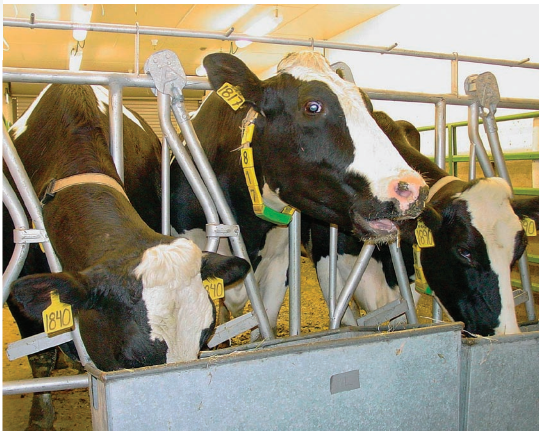
Holstein dairy cows were housed in an environmental chamber for 24 hours to accurately measure all their emissions of greenhouse gases, including methane and nitrous oxide; the cows were fed a total mixed-ration diet.

California is the leading dairy state in the United States, producing 21% of the nation's milk supply. The state's highest concentration of dairies is in the San Joaquin Valley, a region that violates federal limits for ozone and particulate matter in the air. Volatile organic compounds and greenhouse-gas emissions from dairies contribute to regional air-quality challenges and also play a role in climate change. We used an environmentally controlled chamber to monitor greenhouse-gas emissions from dairy cattle over a 24-hour period, and we measured the emissions from waste slurry using a simulated dairy waste lagoon. This research helps to quantify emissions from dairies in California and suggests possible approaches for their mitigation.