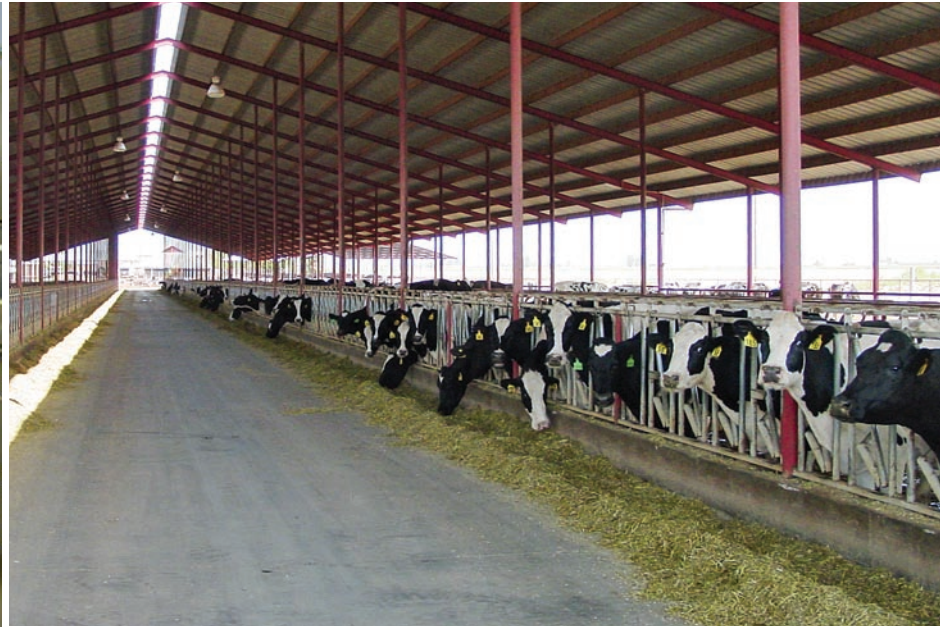
Strategies to reduce methane emissions from dairies include modifying cattle diets to enhance digestibility and improving milk production so that fewer cows are needed.

Volatile organic compounds. In a UC study, Shaw et al. (2007) showed that major volatile organic compounds from cows include methanol. This study also showed that of the volatile organic compounds from cows, the reactive (ozone forming) fraction was 6 to 10 times lower than the value for cows and fresh waste that California regulatory agencies have historically used to develop volatile organic compound inventories for ozone attainment in the San Joaquin Valley. Ozone contributes to global warming and thus all such ozone precursors should be considered in climate-change discussions.