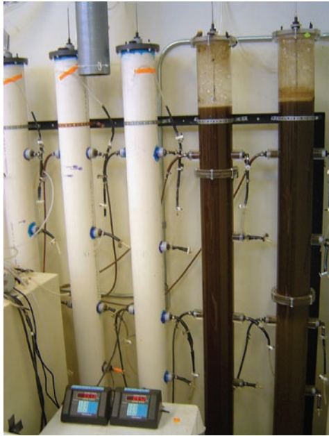
Laboratory-scale reactors were used to test the effectiveness of various manure treatments.