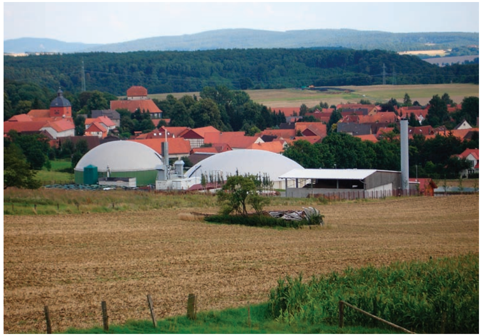
Covered lagoons and methane digesters are an option for reducing greenhouse-gas emissions from dairy waste. In Germany, the village of Juehnde built a digester for livestock waste and other biomass. The methane is combusted to produce electric power and heat for homes in the village, which is the first in the world to go “off the grid” through the use of its own waste.