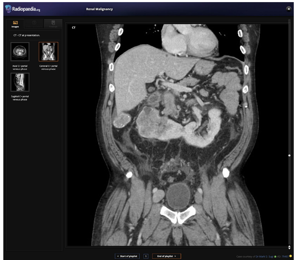
Fig. 2 Radiopaedia full-screen mode viewing platform, which can be integrated into lectures between slides to allow for guiding learners through real-time interpretation of an actual case. Case details can be hidden from the learner by selecting the “hidden diagnosis” link

or non-radiologists, this method is particularly engaging and effective and can be the basis of entire didactic sessions for teaching the basics of using a PACS viewer, identifying basic anatomy and search patterns, and learning the features of common pathology. Indeed, a medical student summarized the strengths well when providing feedback for an abdominal CT conference using these methods: “Having the chance to read scans ourselves under supervision was awesome. I feel a lot more comfortable looking at abdominal CT than I did before this session.” (Online Appendix 11).