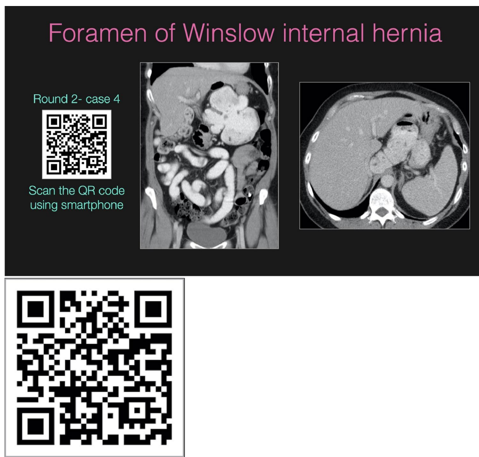
Fig. 3 Use of a QR code in a lecture slide to provider learners with a quick reference to interactive cases that can be accessed via laptop, tablet, or phone during the lecture. A larger version of the QR code is included, and readers are encouraged to test scanning it with their phone's camera app to open the case