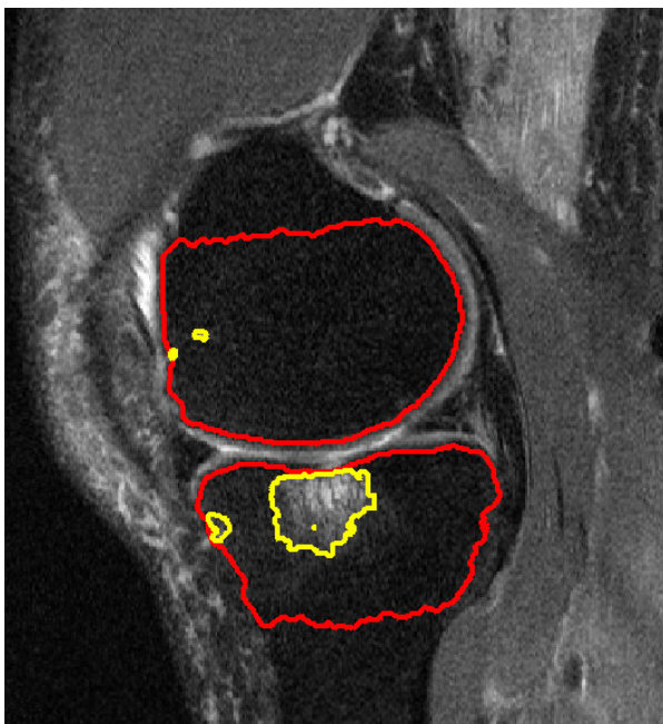
Figure 1 Bone marrow lesion (BML) in the medial tibia. The red lines identify the bone boundary and the yellow lines surround areas of high signal intensity. The three small regions (two in femur, one in tibia) would be excluded from analyses since they do not appear on more than one image.

The Bone Ancillary Study recruited participants ( n = 629 ) in the OAI progression subcohort during their 30- or 36-month OAI visits. An inclusion criterion for this ancillary study was a willingness to undergo additional knee imaging. Exclusion criteria were contraindication for magnetic resonance (MR) imaging and the presence of bilateral knee replacements. For these analyses, we focused on participants in the Bone Ancillary Study with MR imaging at the 24- and 48-month OAI visits ( n = 478 ). We then excluded knees that had imaging artifact (for example, motion) or the bone segmentation program failed to delineate the bone borders ( n = 442 ). From this sample, we selected the first 404 knees as a convenience sample. MR images from these visits were selected because of the time period overlaps with the data collected for the Bone Ancillary Study. This study