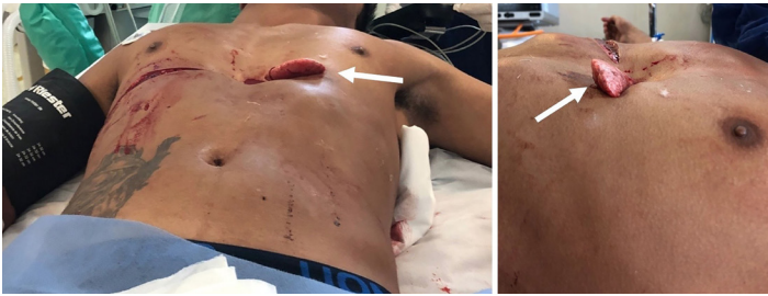
Image 2. The lingula of the lung can be observed protruding beyond the penetrating injury of the thorax, expanding with each inspiration (arrows).

initial hemoglobin of 13.6 grams (g) per deciliter (dL) (reference range: 12.0 – 16.0 g/dL).