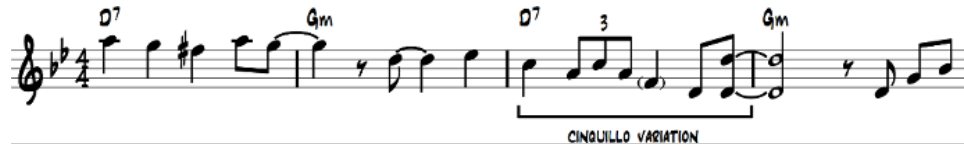
Example 2: Last four bars of the first iteration of Section A of “La linda Ballesteros” as performed by Dorindo Cárdenas.

context, the cinquillo rhythm is deliberately stated or, less commonly, treated to some form of embellishment as shown in Example 2. The significance of the cinquillo as a marker of a “danzón” tradition, Azuerense or otherwise, is only heightened by the fact that it is a central element of the broader Caribbean tradition where it is featured in both danzón melodies and their accompaniment.