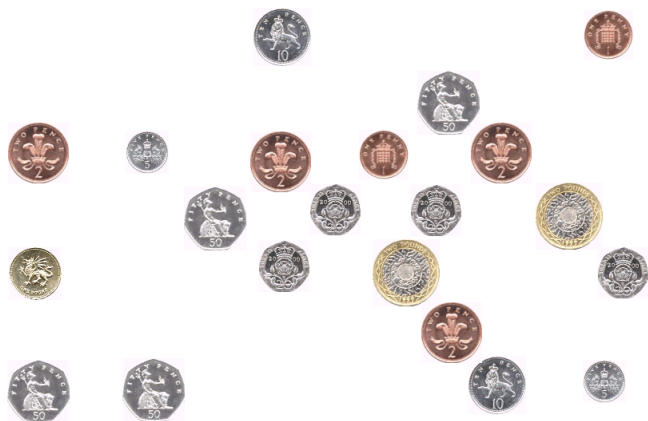
Figure 1: Example screen display of an initial configuration (Participant 3, Trial 9).

are presented with somebody else’s initial or final coin configurations. This ‘yoked’ design allows us to address a related issue of agency : Is it important that people can interact themselves with the objects on display, or will they also benefit from the result of someone else’s interactions? To preview our results, we find that people successfully use physical movements of objects to transform the task and adaptively create structures that are helpful to other problem solvers.