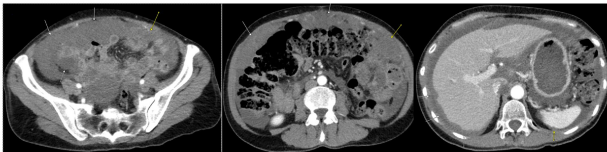
Figure 1. Initial CT scan of abdomen/pelvis completed at time of diagnosis. Arrows indicate diffuse mucinous peritoneal metastases throughout the abdomen and pelvis.

A 53-year-old female with a medical history of cesarean section and bilateral tubal ligation presented to her primary care physician with a six-month history of abdominal distention, bloating, early satiety, and unintentional weight loss amounting to 25 pounds. At this point, a CT scan of her abdomen and pelvis revealed ascites, peritoneal implants, and bilateral adnexal masses (Figure 1). The observed tumor markers were as follows: CA 19-9—1398 units per milliliter (U/mL); CA-125—118 U/mL; and CEA—55.4 micrograms per liter ( \mu\text{g/L} ). Cytology from her paracentesis revealed adenocarcinoma that immunohistochemically favored an upper gastrointestinal versus a pancreaticobiliary origin. However, EGD, EUS, and colonoscopy revealed no masses in the stomach, duodenum, pancreas, liver, or colon, hence indicating a possible appendiceal origin.