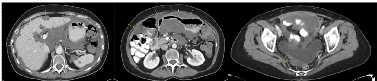
Figure 4. First CT scan of abdomen/pelvis after initial CRS/HIPEC to show disease progression. Arrows indicate diffuse and enlarged mucinous peritoneal metastases and demonstrate interval increase in tumor burden.

Repeat CT after four lines of systemic chemotherapy showed no intrathoracic metastasis and a diffuse, increased volume of low-density peritoneal disease that was more extensive than that observed in prior imaging, with a clear progression of disease in the pelvis and upper abdomen (Figure 4). At this point, the patient was referred to our program for cytoreduction. Given the patient’s young age, the fact that nearly two years had passed since the original cytoreduction, and the patient’s excellent performance status, we decided to proceed with repeat cytoreduction despite the presence of extensive peritoneal disease.