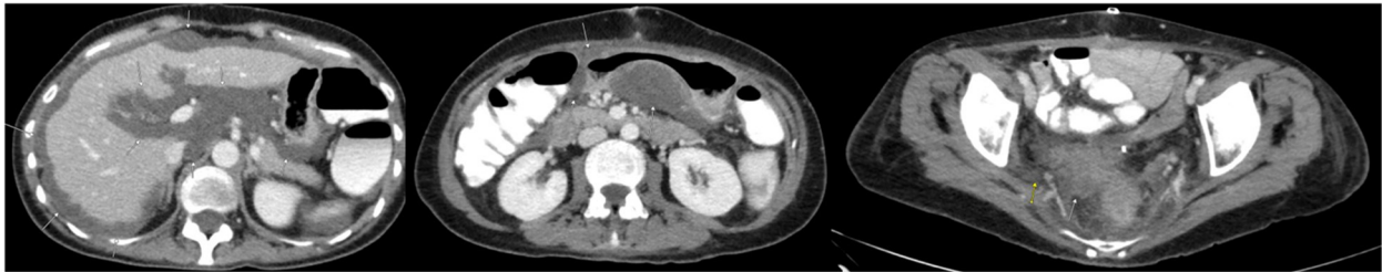
Figure 2. CT scan of the abdomen/pelvis conducted after first CRS/HIPEC. Arrows indicate residual mucinous peritoneal metastases and demonstrate interval reduction in tumor burden.

FOLOFOX, FOLFIRI, and FOLFIRI with Bevacizumab and Lonsurf Trifluridine/Tipiracil (TAS-102) with down-trending CEA (Figure 3); however, there was no significant imaging response.