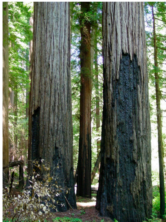
Figure 4. Bark of old redwood trees partially consumed by wildfire.