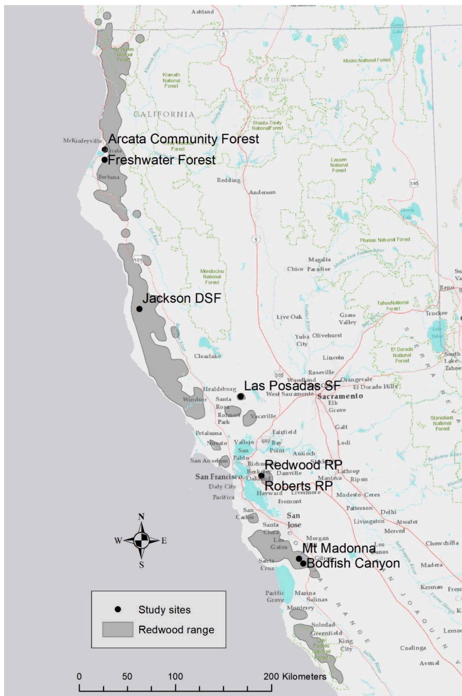
Figure 1. Study sites and approximate range of redwood in northern California and southern Oregon.

southern end of the range (Figure 1, Table 1). Subsets of these data were used to examine the influence of particular variables on BT while other influential variables were held constant. We held age constant to test for genetic effects in terms of differences in the BT among sprout clumps in the same stand. Crown class was also held constant to test for regional differences among stands in the north, central, and southern parts of redwood’s natural range. We studied stand structure and age effects in data from one region, and the tapering of bark along the stem in a single forest. For the purposes of this study, we use the term tree bark in reference to various tissues including the inner living phloem and dead outer tissue [25]. We use the term BT to refer to the radial linear thickness measurement of all materials outside the xylem, i.e., the combination of cellular structures from inside the cambium layer to the outside of the exterior bark.