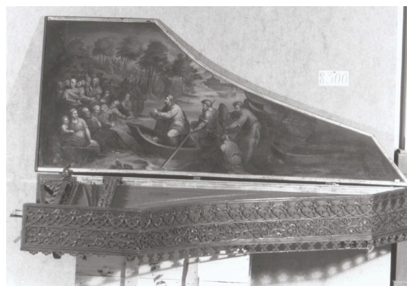
One of six of Landowska’s war-damaged antique keyboard instruments discovered at Raitenhaslach in 1945 and repatriated to France.

Some of the musical objects discovered at Raitenhaslach can be traced back to ERR inventories of objects looted in France, such as the list of items taken from the home of world-renowned Polish harpsichordist Wanda Landowska at Saint-Leu-La-Fôret. In the case of Landowska, only a portion of her large musical collection was recovered at Raitenhaslach. Landowska’s collection and her inventory were confiscated in September 1940, but a noteworthy undated “approximate” inventory of Landowska’s musical collection was located in the course of research in the MAEE, and appears to be Landowska’s post-war reconstruction. Although the Landowska