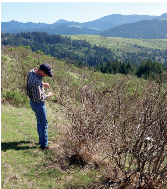
Co-author Jeff Stackhouse inspects brush for herbicide effectiveness.

was 100% more effective ( P < 0.0001 ) than the injection method. For triclopyr, the spray method was 50% more effective than the drizzle method ( P = 0.007 ).