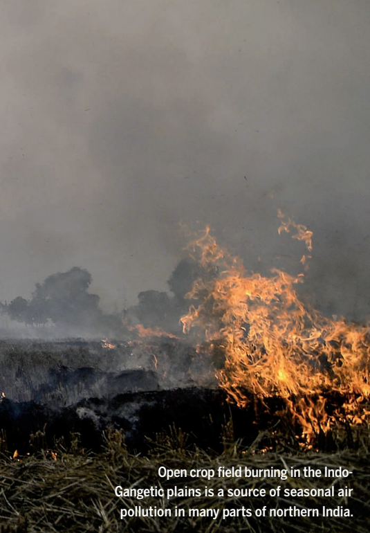
Open crop field burning in the Indo-Gangetic plains is a source of seasonal air pollution in many parts of northern India.

combinations of these options are regularly used in northwestern India, and we focus on 10 combinations that are commonly practiced or are viewed as potentially scalable (fig. S1). The majority of farmers currently choose to burn rice straw, plow fields, and sow wheat using conventional seeders. Given variation in practices, we evaluate the public and private costs and benefits and potential scalability of 10 alternative farming options, three of which result in residue burning.