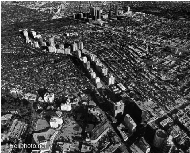
Wilshire Boulevard, Los Angeles' linear downtown

Los Angeles is known throughout the world as an auto-oriented city, yet for the past three decades the region has invested billions of dollars into an ambitious rail and busway network. Given such a significant investment, many find it perplexing that rail service still only partially traverses Wilshire Boulevard, the region's most densely developed and heavily travelled transit corridor. We examine how conflicting political interests manipulated planning analyses and repeatedly dictated highly technical aspects of the subway's routing and design, ultimately delaying the construction of a rail line along the most promising transit corridor in Los Angeles.