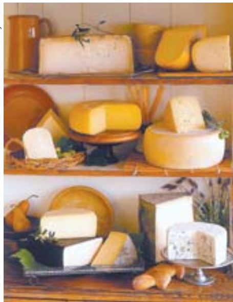
California Milk Advisory Board

what was “put into” the cheese besides milk. “Antibiotic-free” and “hormone-free” foods are also important to the specialty cheese consumer. When asked what they would like to discuss if they could talk to the person raising the cows that provide milk for their cheese, respondents mentioned antibiotics and hormones 12 times and grazing and pasture nine times.