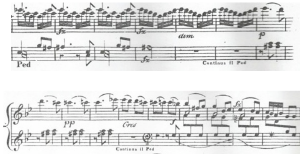
Fig. 15, 3 rd mvt., mm. 265-80.

As mentioned above, Clementi, as a piano maker, was absorbed in the mechanics of the instrument and contributed tremendously to the piano's development. His late keyboard sonatas were the perfect vehicle with which he could experiment with the advances of the pianos he