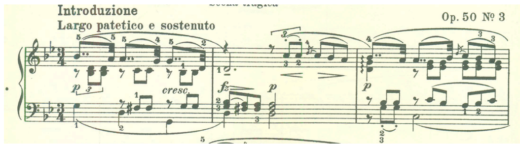
Fig. 27, Clementi, Op. 50, No. 3, mm. 1-3. (Frankfurt, New York: Peters, 1940.)

The small note can be played either on a downbeat or slightly before it.