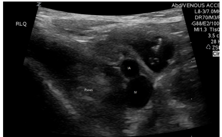
Figure 1. Pre-oral radio-contrast administration: psoas muscle and iliac artery (IA) and iliac vein (IV) labeled.

Both pre- and post-ORC POCUS images were randomized with a non-descript code, and blinded physician-assessors were not aware which images were pre- or post-ORC. Individual subjects were not otherwise identifiable. The physician-assessors of the US images were fellowship-trained in point-of-care emergency ultrasonography and each had performed well over 1000 POCUS examinations, and over