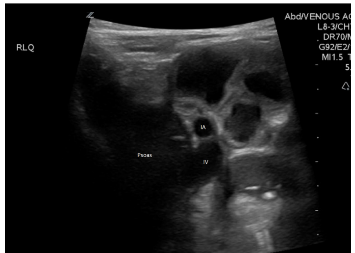
Figure 2. Post-oral radio-contrast administration: psoas muscle and iliac artery (IA) and iliac vein (IV) labeled.

10,000 quality assurance reviews of POCUS examinations. Assessors were blinded to all clinical details and identities and were not involved in recruitment of patients or image acquisition. All POCUS images were compared, evaluated and rated using a five-point Likert scale: 1 = not interpretable; 2 = barely interpretable; 3 = adequate for interpretation but of poor quality; 4 = interpretable and of average quality; 5 = interpretable and of superior quality. 2