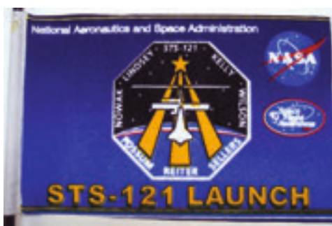
Zastave misija (10×15 cm). Mission Flags (4×6").

down from the upper hoist to the lower fly. Centered on the white portion of the field was the orbiter name in blue, with a silhouette of a shuttle in flight with its payload doors open. On the flags for Atlantis and Endeavour , the shuttle silhouette completely substituted for the letter A, while those on the flags for Columbia and Discovery overlapped with the letter O. At the upper hoist of the flag was the logo of the Manned Flight Awareness Program. Later versions of the flag had an updated logo for the renamed Space Flight Awareness Program. As the Space Shuttle Program came to an end, a flag was also created for Challenger (with the silhouette replacing the letter A).