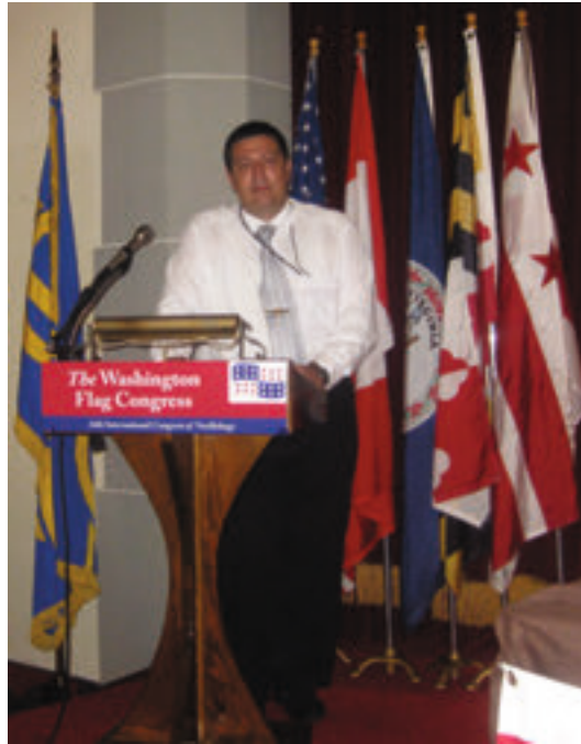
Na Veksilološkom kongresu u Washingtonu 2011. At the Washington Flag Congress 2011

The anniversaries are opportunity to consider what we have been doing and what we have achieved in the previous period. As some of you shall remember, the establishing assembly was held on 4th May 2006 in the Croatian History Museum , and the “zero” number of GiZ was issued in the autumn of the same year. Since the initial dozen and a half members, slowly we have doubled in size, while our Association gained certain respect in the public as well as in the expert and scientific communities in the country and among the colleagues abroad. Soon, based on the activities of our members, we became members of two roof international organizations, CIGH and FIAV, while we also regularly maintain relations with heraldic and vexillologic societies abroad. We have established good cooperation with a series of scientific, museal, archival and other institutions in Croatia, as well as with a number of NGO's. The HGZD members are often giving guest lectures for those institutions and