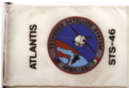
Zastave tereta (10×15 cm). Mission Flags (4×6").

Gore/Top: U.S. Microgravity Payload-1, 1992.; U.S. Microgravity Payload-2, 1994. Dolje/Bottom: U.S. Microgravity Laboratory, 1993.; Tethered Satellite System, 1992.