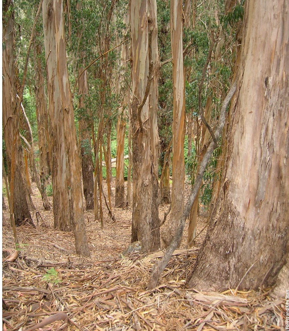
Forest and Kim Starr

Potential allelopathic effects. Del Moral and Muller (1969) reported that natural unconcentrated fog drip from blue gum inhibited growth of annual grass seedlings, and unconcentrated stemflow from blue gum inhibited germination of some herbs. The volume of water channeled down the stem is about eight times more than that of falling rain, such that soil at the base of trunks could receive large quantities of water containing potentially allelopathic compounds. The associated suppression of plant growth at the base of trees is more likely due to allelopathy than water shortage given the amount of