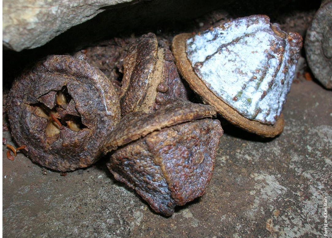
Blue gum eucalyptus trees can produce a large quantity of seeds in woody capsules, but germination rates are generally low.

Fire regime changes and fire hazards. Blue gum was most frequently planted in