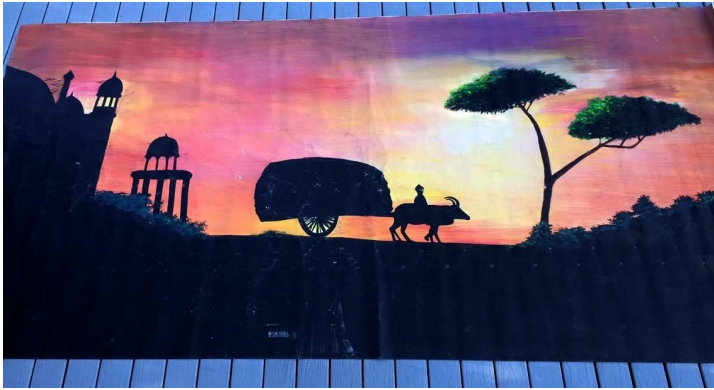
[Image 2, pictured left]: Untitled, (aged) mural painting, acrylic, by Shireen

It's a new dawn, It's a new day, It's a new life, For me And I'm feeling good 8