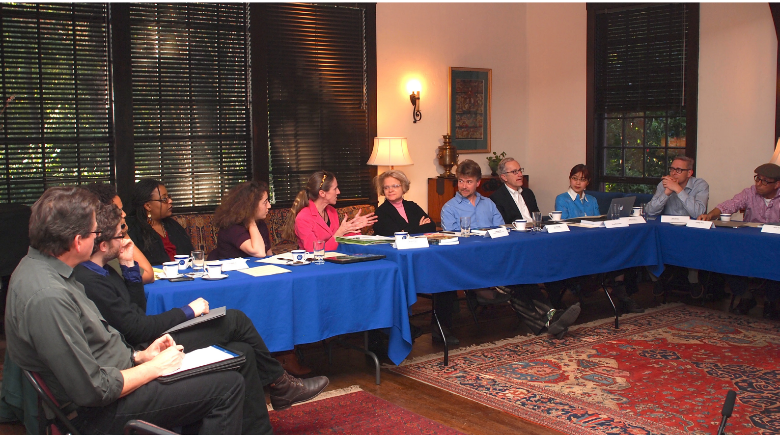
UC Berkeley based scholars discussing 'How to Succeed in Transdisciplinary Research by Really Trying Hard'