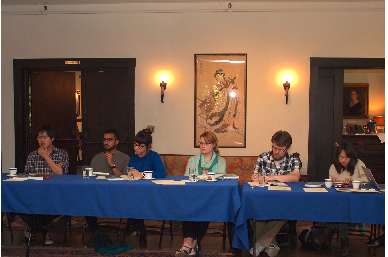
Engaged attendees listening to the round table discussions at the Symposium