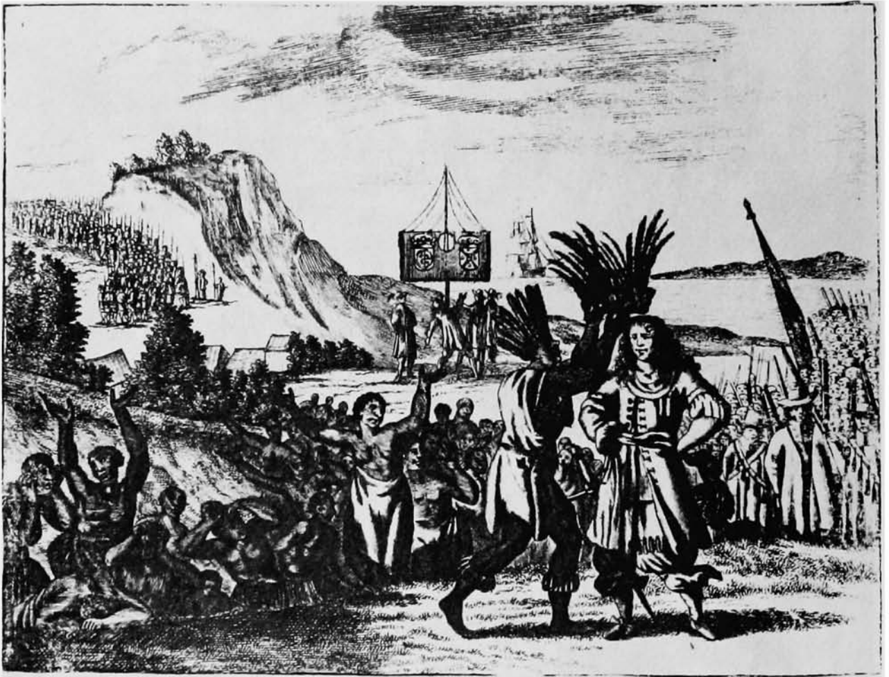
Fig. 4. Francis Drake being crowned by California Indians, from A. Montanus ( De Nieuwe en Onbekonde Weereld . . . ), Amsterdam, 1671. The right side of the banner has been identified as presenting the coat of arms of the city of Plymouth, England, the port from which Drake set sail in 1577 and to which he returned three years later, after having circumnavigated the globe. Note that the presumed figure of Drake is shown here without a beard.

representation of the "Drake's Plate," mounted on a post. Its great size compared to the metal plate usually referred to as the original one, now in the Bancroft Library of the University of California, may be explained in this drawing as artistic necessity. One of the glaring inconsistencies of the picture is that there are shown four apparently good-sized ships, some under heavy sail, in the bay, with the wind apparently coming from two directions. It has already been mentioned (see comments for Fig. 1) that Drake had, at most, two ships during this part of his voyage.