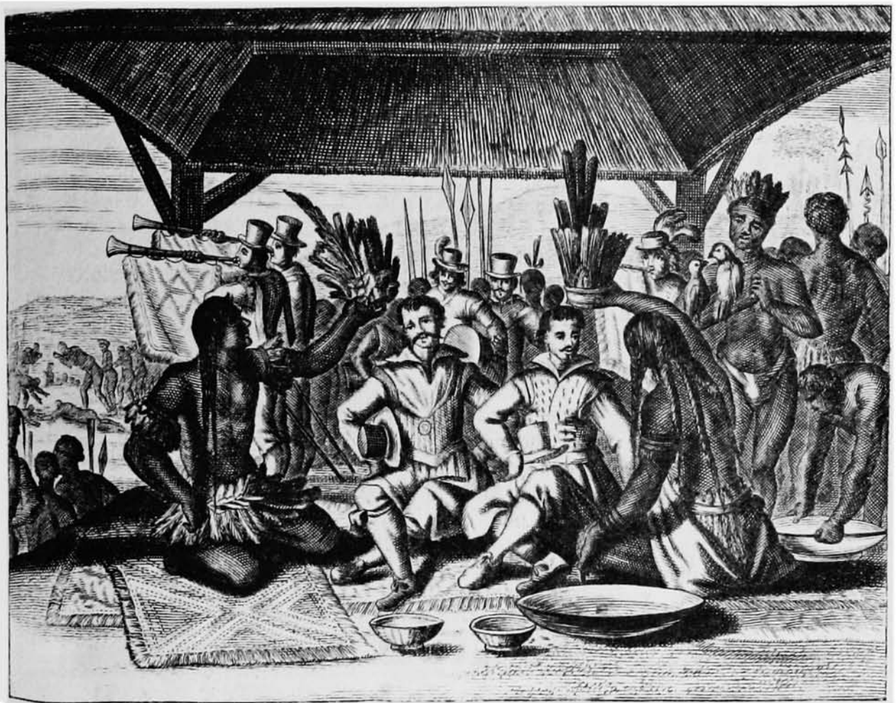
Fig. 5. Two leaders of a Dutch expedition in the Pacific Ocean, W. Schouten and J. Lemaire, are shown being crowned on Hoorn (Futuna) Island, in western Polynesia, ca. 1616 (Montanus 1671). Note resemblance of feather headdresses to those of California.

The group of houses here may be parts of a fort, mentioned in the earlier accounts, but where is the surrounding wall? It is also unlikely that these houses were completed so soon after the arrival of the ship in the bay; surely the nature of the scene itself implies landing only a few days or even hours before the ceremony. On the other hand, the houses almost certainly cannot be interpreted as Indian structures.