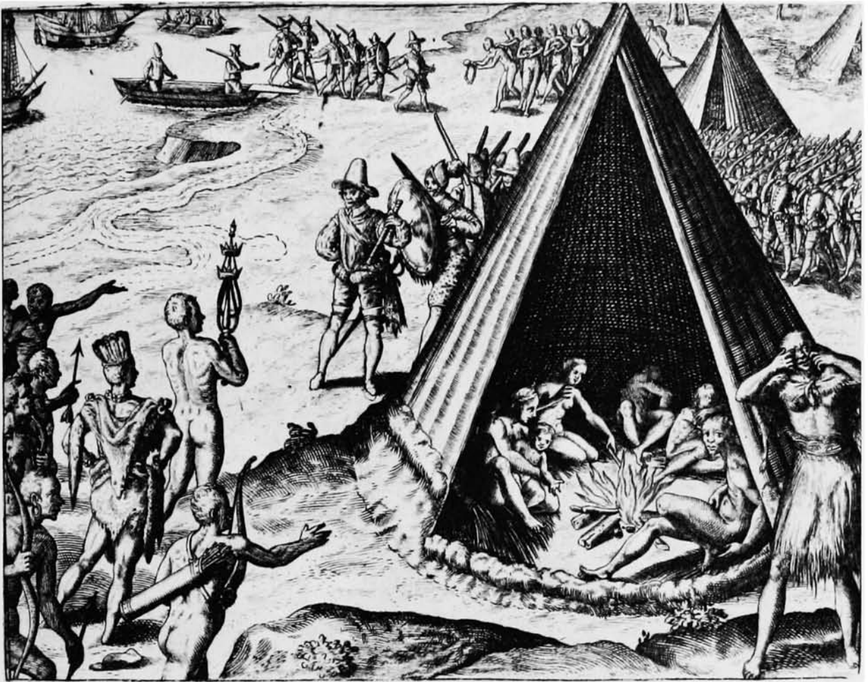
Fig. 1. Indians welcome Francis Drake to California in 1579—an engraving from a book by Théodor deBry ( Historia Americae ), published in Frankfurt in 1599. This was the first published picture of California Indians.

herein), five of them essentially from the seventeenth century and two from the mid-nineteenth century. The following comments on each of the drawings indicate the difficulties of establishing what may have happened to the drawing between the time of the actual event depicted and its later appearance in a printed publication. Even the late sixteenth-century artist or engraver of the first of the Francis Drake series presented here (earliest drawing dated 1599, 19 years after the world-encompassing voyage) may be accused of eclecticism or compositeness. While the later illustrations of crowning episodes in the voyages of Schouten and Lemaire, published