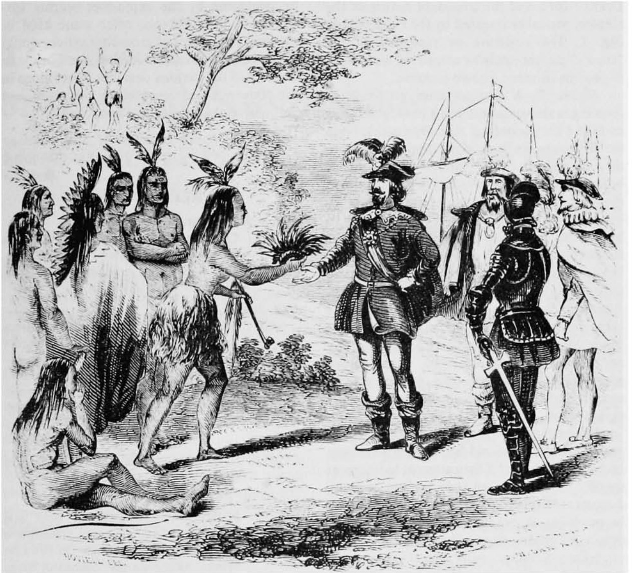
Sir Francis Drake and the California Indians.

Fig. 7. Illustration signed by Howell, engraved by J. W. Orr, from a book titled The Annals of San Francisco Bay , New York, 1855. The drawing style is characteristic of nineteenth century illustrations, with presumably inaccurate details, however, of the same order as those appearing in the sixteenth or seventeenth century drawings representing Francis Drake's landing in California.