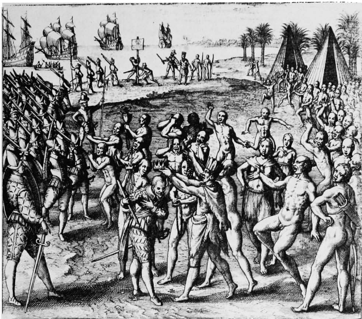
Fig. 3. Another engraving from J. L. Gottfried ( Neue Welt... ), 1655, showing crowning of Francis Drake in California. Note similarity of house types to those shown in deBry (1599) engraving (see Fig. 1), and possible depiction of "Drake's Plate" on post.

Sir Walter Raleigh's "crowning" in Guiana in 1595. Note the native chief's feather headdress, like those shown for California (cf. Fig. 3, taken from the same volume, i.e., Gottfried 1655). One of Raleigh's officers, presumably, is shown smoking what appears to be a cigar; the fruit offerings by the natives certainly could represent tropical species. However, the coastline depiction is not strikingly reminiscent of the tropical forest land near the mouth of the Orinoco River, but happens to