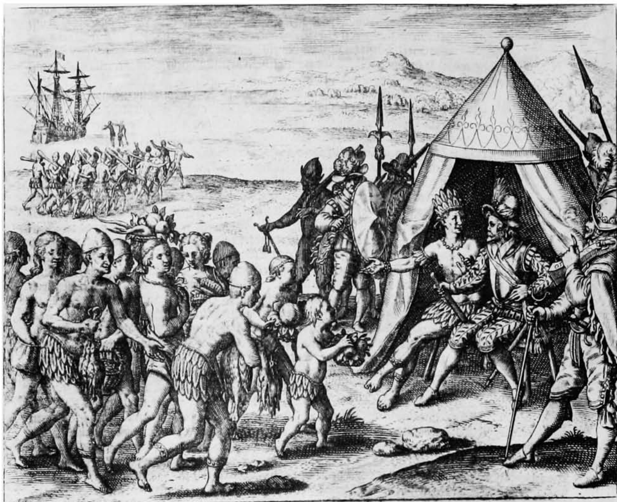
Fig. 2. Engraving from J. L. Gottfried ( Neue Welt und amerikanische Historien), Frankfurt, 1655, showing Sir Walter Raleigh being crowned in Guiana, Orinoco River region, South America, 1595.

same category are the conically-shaped houses; such dwellings have been only verbally documented by later Coast Miwok Indians, the original occupants of the region where Drake most likely careened his ship (cf. Heizer 1974:28). The faulty perspective of the ships and boats is acceptable, esthetically, but tells us practically nothing about the true design of Drake's ship, the Golden Hinde , or of a small, previously captured pinnace which allegedly was accompanying him for part of the time when he was sailing along the Pacific Coast.