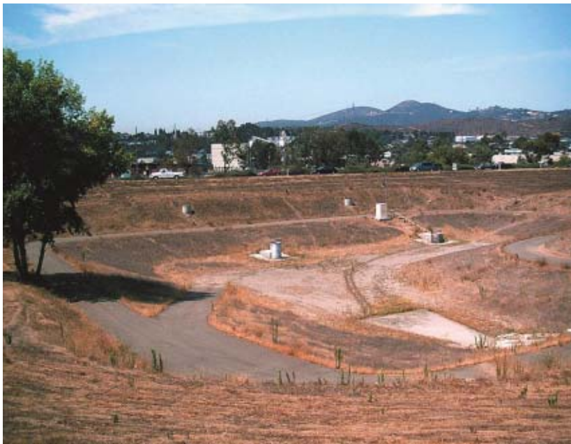
Figure 7. An example of a well-designed perimeter road and access ramp to the basin floor. Adequate access in and around BMP devices such as this large extended detention basin are critical for maintenance activities and vector control.