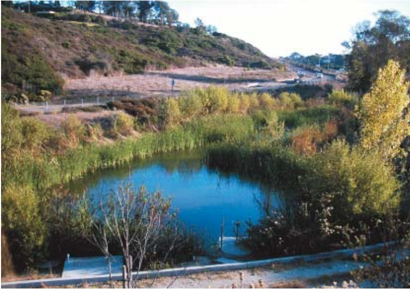
Figure 6. Stormwater treatment ponds and constructed wetlands form complex biological systems in which mosquitoes can be difficult to control. Effective mosquito management in these habitats requires careful planning before, during, and after construction. Mosquito suppression in this stormwater pond was achieved by following guidelines provided in this publication, i.e., weekly larval monitoring, annual removal of emergent vegetation, and maintenance of a healthy mosquitofish population. Additional guidelines for managing mosquitoes in surface-flow constructed wetlands are available and should be consulted (see Walton 2003).

these kinds of projects must be evaluated; if any doubt exists, consider alternate treatment devices. For example, feasibility studies of subsurface flow treatment wetlands are currently under investigation and may provide excellent mosquito-free alternatives (see Anonymous 2002).