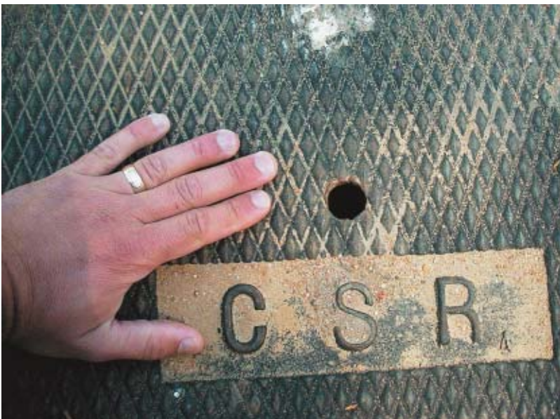
Figure 5. Mosquitoes can access underground sources of water in treatment BMPs from many places, including inlet and outlet pipes, loose-fitting covers, and vent holes. As a general rule, any gap \frac{1}{16} inch (2 mm) or greater is large enough to allow egg-laying females to enter. The hole in this manhole cover is more than large enough to allow mosquito entry.

penetrate openings as small as \frac{1}{16} inch (2 mm) to gain access to water for egg laying (fig. 5). Screening can exclude mosquitoes, but it is subject to damage and is not a method of choice.