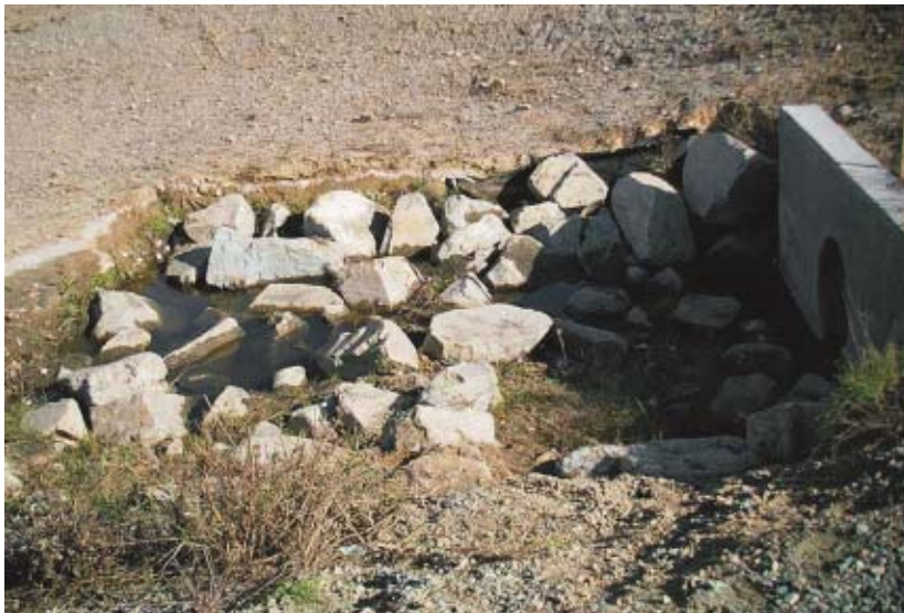
Figure 3. The use of loose rocks (riprap) to dissipate the energy of incoming runoff encourages mosquito production. Inevitably, standing water collects between the rocks, providing habitat for mosquitoes and making monitoring and control very difficult. A low-maintenance sloped concrete slab with imbedded rocks or concrete blocks is recommended as an alternative.