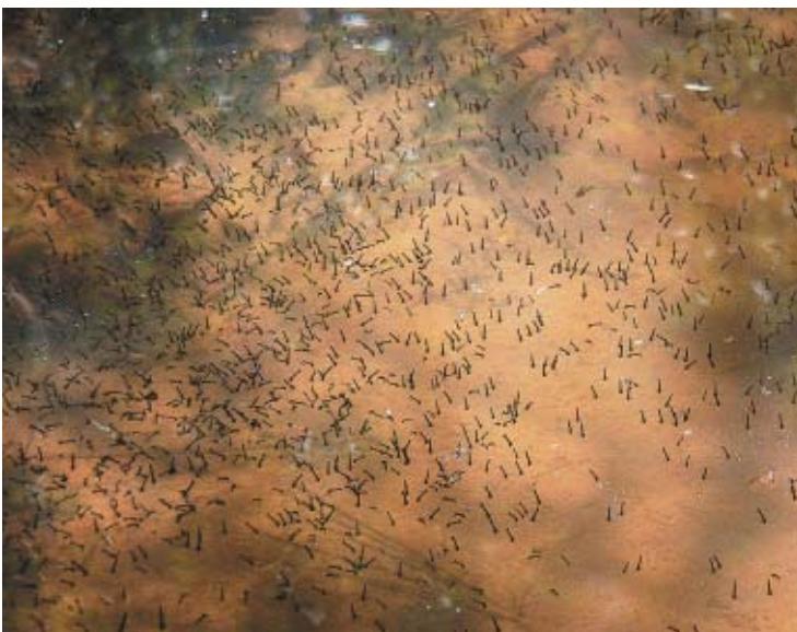
Figure 2. Waters rich in accumulations of organic materials created by some treatment BMPS provide ideal larval habitats for many species of mosquitoes, including those that can transmit human diseases. The standing water in this small roadside stormwater basin harbored hundreds of mosquito larvae and illustrates the reproductive potential of mosquitoes when provided with suitable habitat.

Location can greatly affect whether a treatment BMP becomes a significant source of mosquitoes. For example, identical structures in different locations may vary widely in potential mosquito production due to the number of mosquitoes present in the area, the species composition, and the duration of breeding activity. Elements that may influence the mosquito breeding potential in any given location may include a variety of environmental, construction, and local factors operating singly or in combination (table 1). Because of their propensity to breed mosquitoes, all treatment BMPS, regardless of their design, should be monitored periodically by vector control professionals with knowledge of the biology and ecology of local mosquito species. A more proactive approach would be to include vector