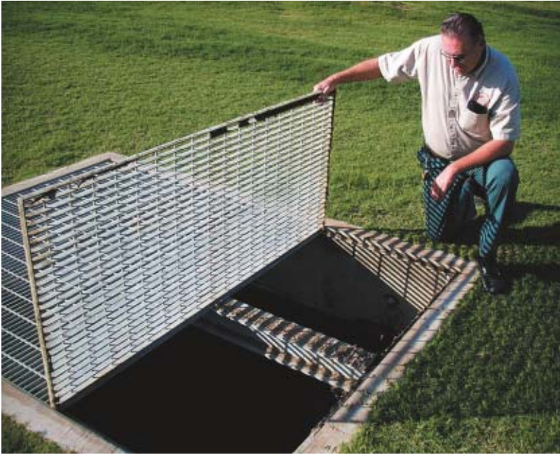
Figure 4. Stormwater treatment BMPs that hold permanent sources of standing water, especially belowground devices, pose a difficult challenge to mosquito exclusion efforts. A cooperative effort between stormwater professionals, municipal planners, public health officials, vector control agencies, and others is crucial to developing novel techniques that eliminate or deny mosquitoes access to standing water. Contact the state or local public health or vector control agency to discuss local vector issues and provide input and consultation on siting, design, and maintenance of proposed treatment BMPs.