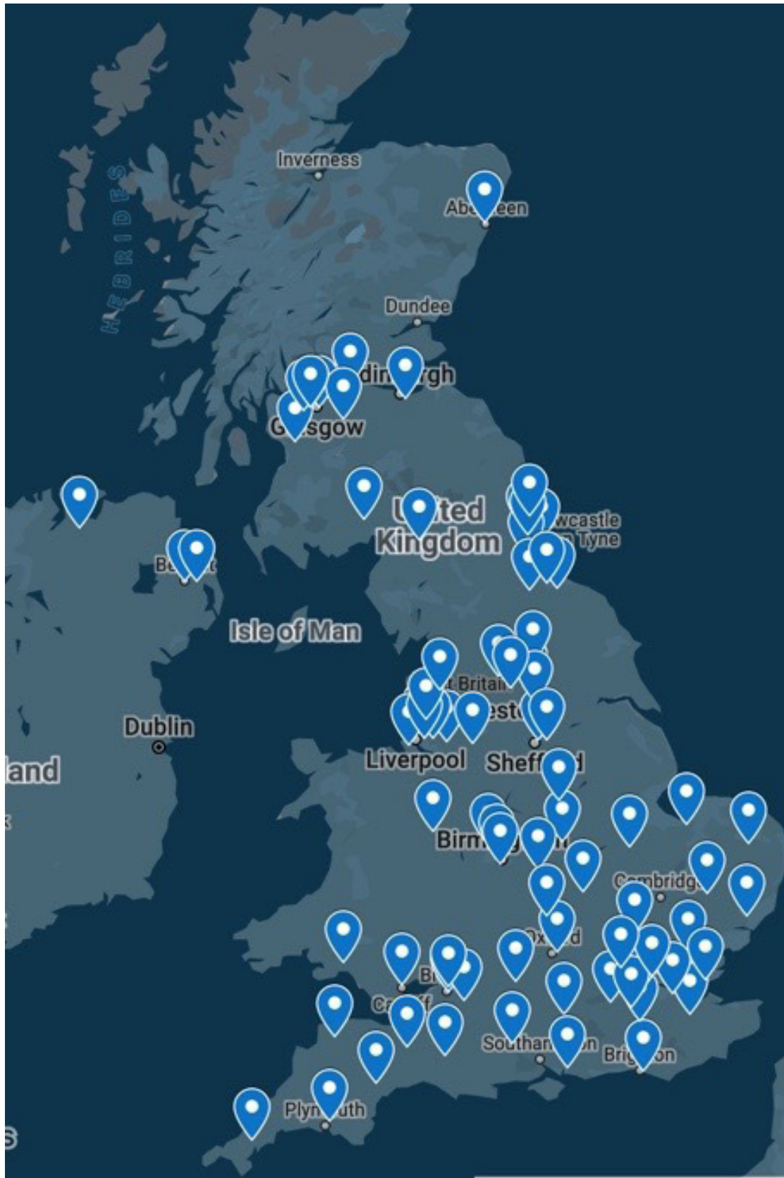
Fig. 1 Distribution of enrolled sites.