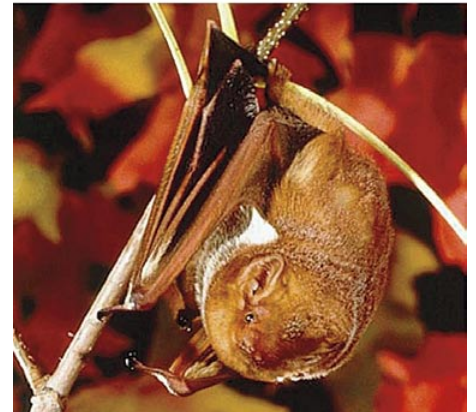
Bats found in California include: top to bottom, hoary bat, Mexican free-tailed bat and red bat.