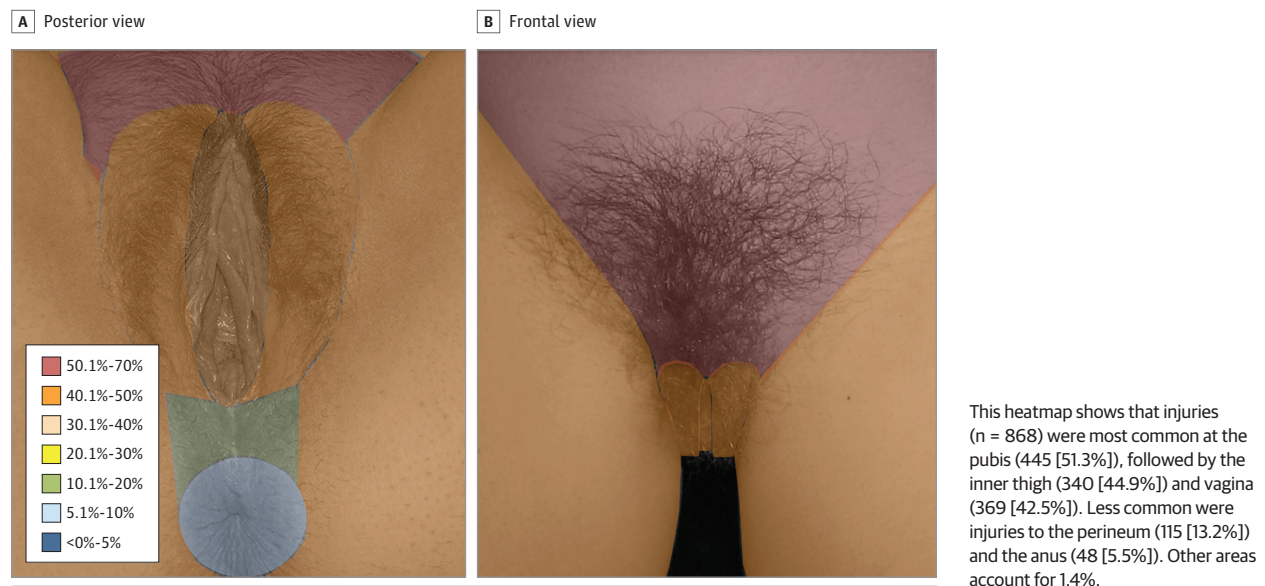
Figure 2. Prevalence and Distribution of Female Grooming-Related Injuries

injuring the scrotum (378 [67.2%]), followed by the penis (196 [34.8%]) and the pubis (162 [28.9%]). For women, the most commonly injured site was the pubis (445 [51.3%]), followed by the inner thigh (340 [44.9%]), the vagina (369 [42.5%]), perineum (115 [13.2%]), and the anus (48 [5.5%]).