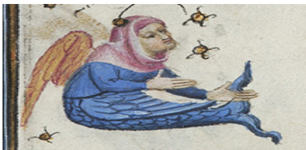
Figures 11. A winged siren from ca. 1418 wears a headdress and a shirt. 18

Medieval artists depict mermaids as primarily naked and exposing their breasts. Unlike their male counterparts, mermaids rarely wear cloth garments like shirts or hats (see fig. 11 and see fig. 12). Even when standing next to an armored merman, mermaids lack clothing of their own. Evidently, the bodies of mermaids exist to emphasize and display their sexuality and femininity.