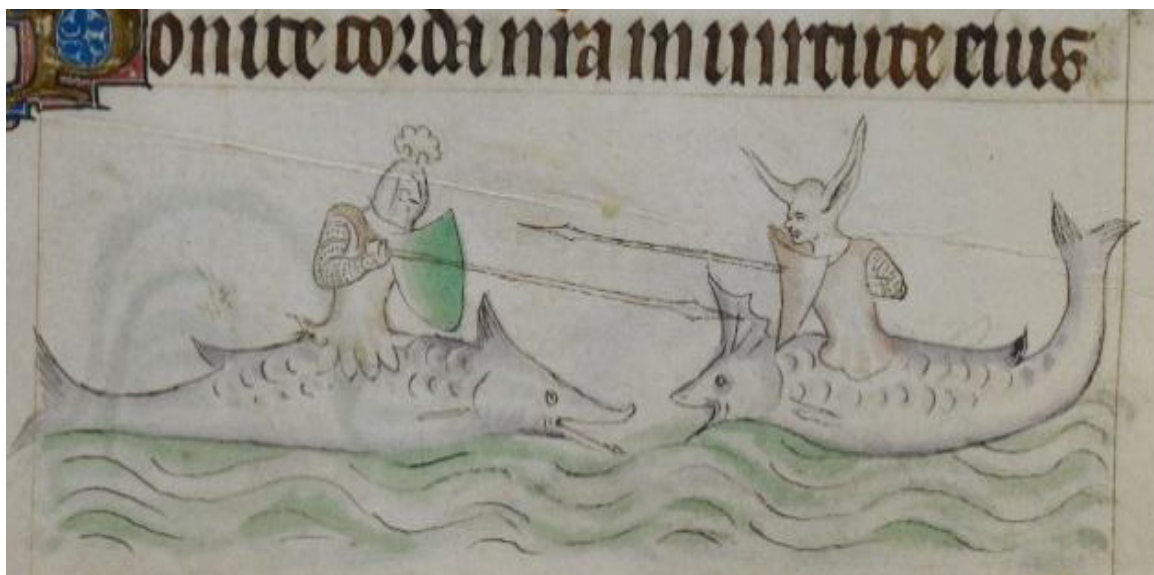
Figure 20. Two mermen from ca. 1310-20 joust each other. 35