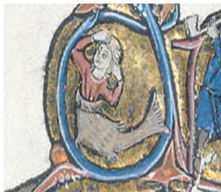
Figures 12. Androgynous merfolk with clothing. 19