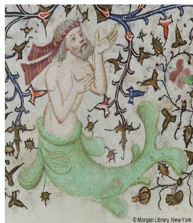
Figure 13. Medieval mermen wear clothing much more than Medieval mermaids. On the left, a merman from ca. 1350 wears a helmet and a shirt. 21 In the middle, a merman from ca. 1320-1330 wears a helmet and a shirt. 22 On the right, a merman poses shirtless in his solitude, but he wears a bandana around his head. 23