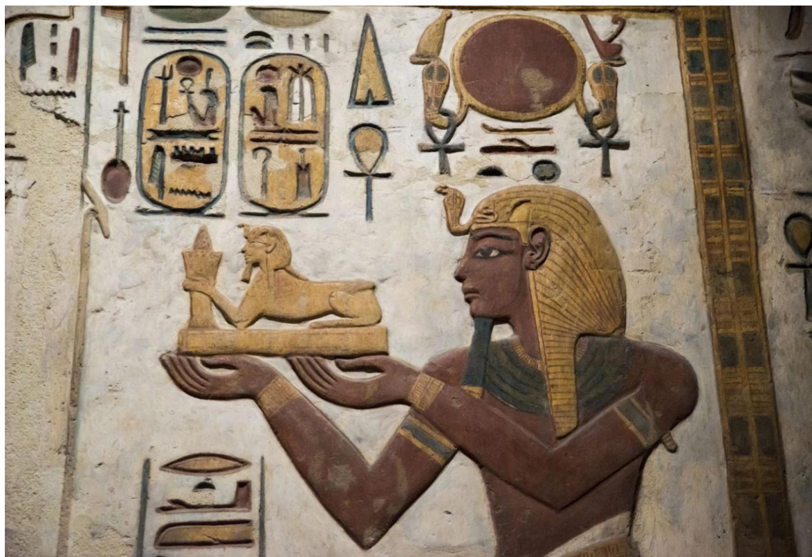
Figure 18. Khonsu, the Egyptian god of the moon, appears in the Temple of Khonsu with a moon disk above his head. 31

the association between women and vanity. In this sense, the mirror reflects the sins of the individual looking into the mirror. Consequently, Medieval artists depict mermaids as female archetypes looking into mirrors to reflect the sinful vanity of women and their responsibility for mankind's sinful nature.