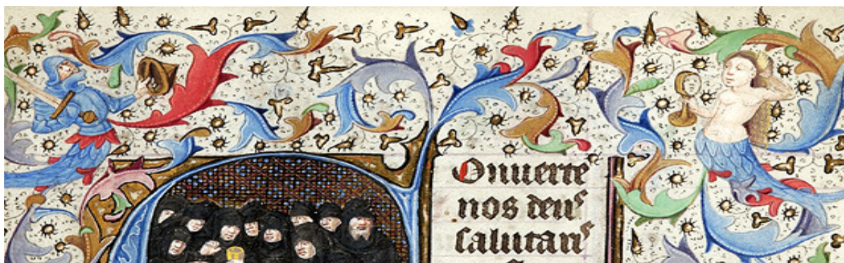
Figure 23. A merman and mermaid from ca. 1500 appear together on the page of a manuscript. 41 On the left, a merman draws a bow and arrow. On the right, a mermaid holds a mirror in her right while she combs her hair with her fingers or a semi-visible comb.

These images have critical social implications for Medieval women during these periods. While Medieval scribes write these psalters, artists paint images unrelated to the text on the page. Thus, as Medieval readers read religious psalters, they witness these unrelated images of a naked mermaid or an armored jousting merman on the page. Consequently, readers must ask themselves to consider the purpose of these images and whether they provide any meaning to the texts themselves or instead images act like graffiti on the pages of these manuscripts. The idea that a man or woman could be sitting and reading a Medieval manuscript containing religious psalters but then glance to the side of the page and witness an image of a Medieval mermaid exposing her breasts and accentuating her sexuality feels particularly damning to the female population. Since the mermaids provide no significance to the text, the image of the mermaid makes women feel like decorative objects. While mermen randomly appear in heroic situations like wielding weaponry or engaging in combat, mermaids exist solely for viewing pleasure. Medieval women reading these psalters could not get inspired by the bravery and heroism of mermaids like Medieval men reading psalters could look at images of mermen and relate to them or feel encouraged or impassioned by the heroism that these mermen depict. In other words, the presence of these images in these Medieval manuscripts greatly influences the people who consume these