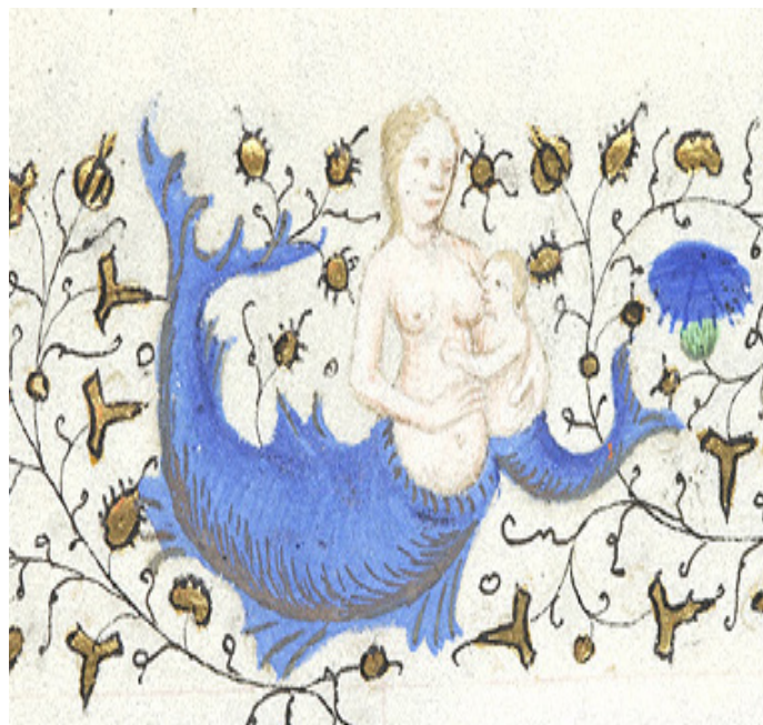
Figure 7. A mermaid from ca. 1401-1450 nurses her child, but her both her nursing and non-nursing breast remain exposed. 10

These images of Medieval mermaid motherhood also emphasize the variation in breast exposure that further accentuates the sexual transformation of breasts that Medieval mermaids endure. In fig. 6, the Medieval mermaid nurses her child with round, perky breasts. While the mermaid in fig. 6 covers her non-nursing breast with her arm, the mermaid in fig. 7 does not cover her non-nursing breast. Evidently, mermaids become more