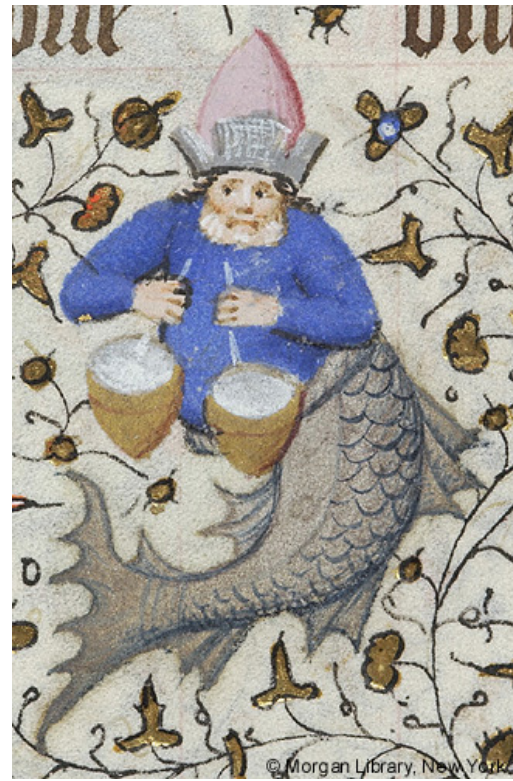
Figure 19. On the right, a merman from ca. 1420-25 plays the drums with drumsticks. 33 On the left, a merman from ca. 1425-30 holds a pitcher in his right hand and a cup in his left hand. 34