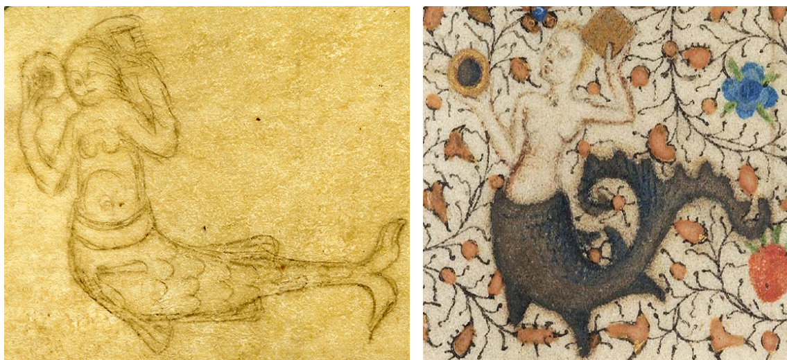
Figure 9. Mermaids from 1300 to 1418 have shorter, less visible hair. On the left, a mermaid from ca. 1350–1374 with short hair holds a mirror in her right hand and a comb in her left hand. 12 On the right, a mermaid from ca. 1420 with short hair holds a mirror in her right hand and a comb in her left hand. 13