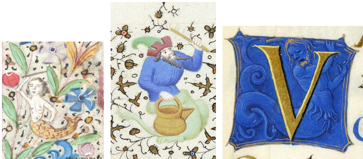
Figure 21. Mermen raise sticks above their heads. On the left, a merman from ca. 1475 raises a stick above his head using his right arm. 36 In the middle, a clothed merman from ca. 1480 holds a pitcher in his right hand and raises a stick above his head with his left arm. 37 On the right, a merman looks behind him as he raises a stick above his head with his right arm as though preparing to strike. 38

While mermen assert their masculinity by wearing armor, posing with weaponry, and engaging in combat, mermen also emphasize their masculinity by raising sticks over their heads. In various Medieval manuscripts, artists depict mermen as raising rod-like objects above their heads (see fig. 21). These mermen hold these objects both alone and in the presence of mermaids, but mermaids do not hold these sticks above their heads. While some viewers may interpret these images as mermen holding miscellaneous objects without any significance, the presence of the rod enables the mermen to have a sexual presence due to the phallic shape of the stick.