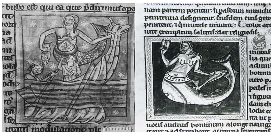
Figure 1. Early depictions of mermaids showcase drooping breasts. On the left, a mermaid from ca. 1230-1240 holding a fish in her right hand. 3 On the right, a mermaid from ca. 1210 holds a comb in her right hand and a fish in her left hand. 4

The sexuality of mermaids remains most apparent in the visibility of their breasts. Medieval mermaids lack the seashell bras that modern mermaids enjoy; instead, during the early depictions of Medieval merfolk and sirens, the bare breasts appear saggy and deflated (see fig. 1). However, the breasts of merfolk and sirens receive less emphasis between 1250 and 1350 (see fig. 2). While the silhouette of the breast shape remains apparent, the contour of the breasts and detailing of the nipples remain faint. Later, from 1350 to 1500, Medieval artists depict merfolk and sirens with more idealized breasts. These breasts typically appear larger, rounder, perkier, and with greater nipple detailing (see fig 3). In other words, early depictions of Medieval mermaid breasts remain basic biological features of mythical female humanoids, while later depictions of Medieval mermaid breasts serve to enhance their sexuality.