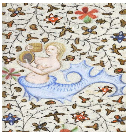
Figure 3. Mermaids from 1350 to 1500 appear with idealized breasts. A mermaid from ca. 1425-1430 with round, perky breasts holds a comb in her right hand and a mirror in her left hand. 6