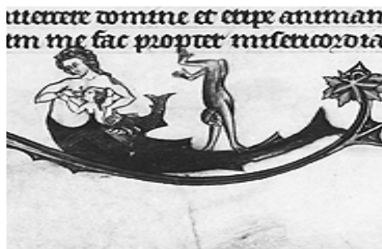
Figure 6. A mermaid from ca. 1250-1300 nurses a child while a demon dances on her tail. 9 She covers her non-nursing breast with her arm while she squeezes her nursing breast. The child's body covers the nursing breast with its body, and the child appears to have a single breast of its own.

Even though fig. 5 showcases two double-tailed mermaids giving birth, two blue cloth garments conceal the breasts of the mermaids. This remains particularly fascinating since breasts exist for the biological purpose of providing newborn children with nutrients. So, this Medieval manuscript image seems like one of the primary instances where artists would expose the breasts due to the biological nature of the scene. Given that this image appears from 1270 to 1280, however, the mermaid fits appropriately into a period where Medieval manuscript artists had not begun emphasizing and idealizing breasts yet. Thus, the artist does not oversexualize the breasts, instead opting to emphasize their biological utility without putting them on display for decorative pleasure.