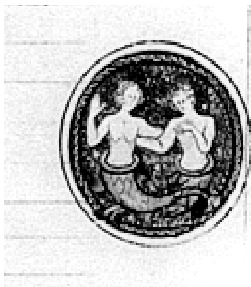
Figure 4. Compared to mermaids, mermen showcase flat pectoral muscles instead of breasts. On the left, a mermaid raises her right hand to expose her breasts in full view. On the right, a merman raises his left arm to conceal his breast-less chest. 7