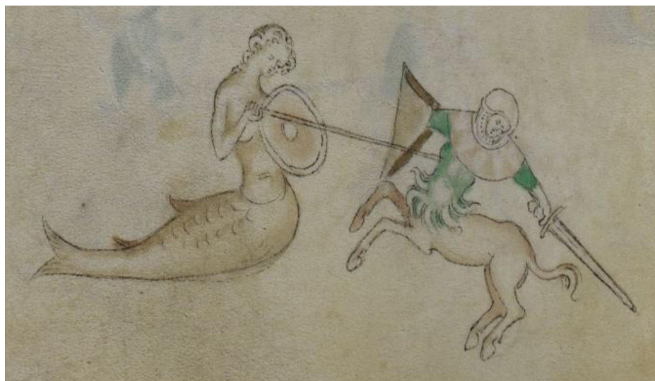
Figure 15. A mermaid raises a shield in her left arm as she lunges a lance towards a centaur with her right hand. 27