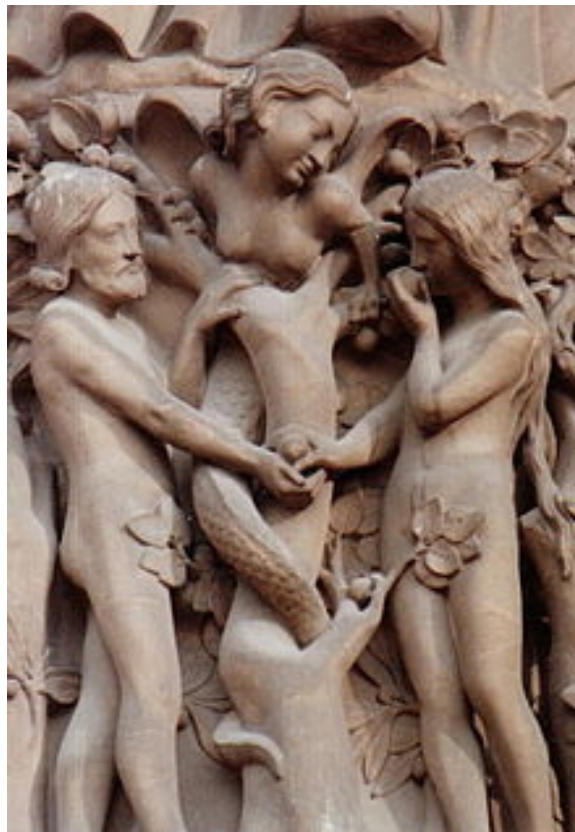
Figure 17. Constructed in the 13 th century, this sculpture at the entrance to the Notre Dame Cathedral depicts Adam and Eve with the Serpent, and the Serpent's face appears as a reflection of Eve's face. 30

In fig. 17, the serpent appears as a reflection of Eve's face to emphasize Eve's vanity. Since Eve vainly admired her own beauty and plucked the forbidden fruit, she bears responsibility for the fall of humanity and