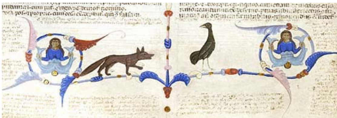
Figure 5. Two double-tailed mermaids from ca 1270-1280 wear blue shirts and pull their tails apart as though emphasizing their births. 8

Medieval manuscripts depict mermaids and motherhood through two mediums: breastfeeding and birthing. In these depictions, motherhood appears as a solitary activity with no mermen present to provide parental support. Admittedly, depictions of Medieval mermaids engaging in maternal activities remain scarce. Mermen did not begin appearing regularly in Medieval manuscripts until 1400, so early artists lack exposure to the idea of merfolk as feminine and masculine; typically, one associates merfolk with mermaids as opposed to mermen. In other words, people generally consider mermaids to resemble a specific mythological female archetype as opposed to merfolk resembling an entire species with both feminine and masculine counterparts that can mate and produce offspring. So, early artists more commonly consider merfolk fantastical creatures as opposed to humanoids with children.