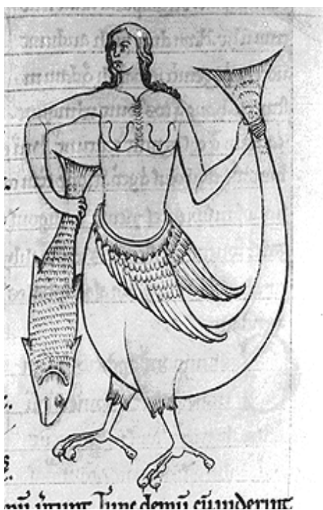
Figure 8. Mermaids from 1200 to 1300 have long but unaccentuated hair. A siren from ca. 1200 and 1210 stands with long hair falling down her back as she holds a fish in her right hand and her fish tail in her right hand. 11

From 1300 to 1418, the hair appears short, hidden by a helmet or head covering of some sort, or obscured because the angles of the mermaids' postures cause the hair to disappear down the backs of the mermaids (see fig. 9). From 1418 to 1500, some artists begin depicting mermaids with deliberately longer hair again. Specifically, artists draw long, flowing hair and somewhat emphasize the visibility of the hair regardless of the angle of the merfolk; even forward-facing merfolk show accentuated hair that peers out from behind the mermaids' backs (see fig. 10).