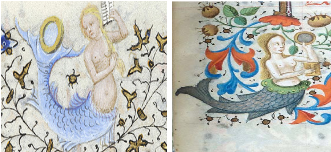
Figure 16. Later depictions of mermaids primarily showcase mermaids combing their hair and looking into mirrors. On the left, a mermaid from ca. 1420-1425 combs her hair with her left hand as she supports a mirror with her fish tail. 28 On the right, a mermaid from ca. 1440-1450 with long hair holds a comb in her right hand and a mirror in her left hand. 29