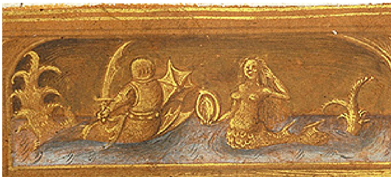
Figure 22. A merman and mermaid from ca. 1445 appear together on the page of a manuscript. 40 On the left, a merman holds a shield in his left hand and a sword in his right hand. On the right, a mermaid holds a mirror in her right hand while she combs her hair with her left hand.