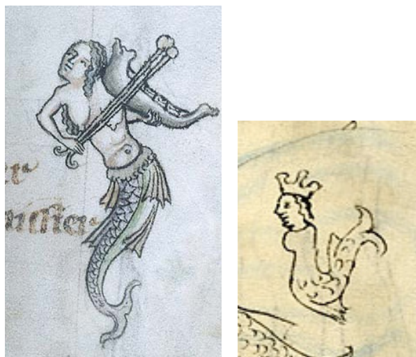
Figure 14. Early depictions of Medieval mermaids showcase mermaids playing music or standing idle, while later depictions of Medieval mermaids showcase mermaids looking in mirrors and combing their hair or standing in revealing poses. On the left, a mermaid from ca. 1350 plays the jawbone with a pair of tongs. 25 On the right, a mermaid from ca. 1380-99 poses idle. 26

In this sense, mermaids act as a somewhat evil feminine archetype. However, from 1400 to 1500, mermaids begin emitting more sexuality. Artists begin depicting Medieval mermaids as primarily looking in mirrors and combing their hair (see fig. 16) while disregarding previous actions, such as playing instruments 24 or standing idle without emphasis. Later depictions of Medieval mermaids show not only mermaids combing their hair and looking in mirrors, but also mermaids raising their arms and exposing their breasts as though specifically posing to show off their bodies. Thus, later artists ensure that mermaids primarily exude sexuality given their sexually suggestive appearances.