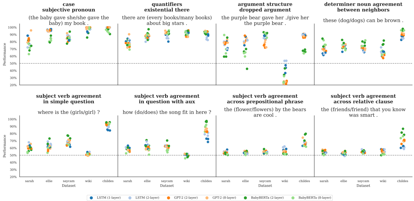
Figure 1: Zorro test accuracies across different settings. We tested 6 model architectures on 23 linguistic tests in Zorro. Each model architecture, trained with 3 seeds, yielded 18 accuracy data points per dataset. Our scatter plots show results for 8 selected tests, with the test name and an example sentence pair (unacceptable/acceptable) highlighted above each. For example, models evaluate which is more acceptable in the “case–subjective pronoun” test: “the baby gave she my book.” or “she gave the baby my book.” We found models trained on single-child datasets excel in specific tests but struggle in others, like subject-verb agreement. Four high-performing tests are shown in the first row, and four lower-performing tests, particularly for subject-verb agreement, are in the second row. Chance is the dotted line. Runs with 3 seeds show variability, similar to previous findings (Sellam et al., 2022; Yedetore et al., 2023).

Wang et al. (2023) conclusion from previous evaluations. As a comparison, models trained on CHILDES achieve higher test accuracy than models trained on other datasets, yet there is a noticeable variance in their accuracy as shown in the bottom right plot of Figure 1. This variability underscores the challenge of mastering the syntactic knowledge required for subject-verb agreement tests, despite the more enriched linguistic context CHILDES provides. More generally, the CHILDES corpus, which is much larger than other datasets, also yielded the best performance in many other tests.