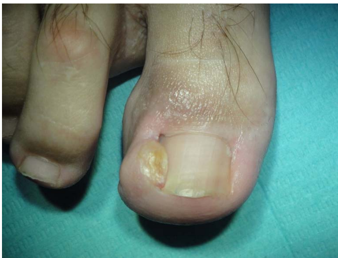
Figure 3. Stage III onychocryptosis of the right first toenail. Note the formation of epithelialized granulation tissue and marked nail fold hypertrophy on the lateral aspect of the nail plate.

Conservative approaches are used first-line because they are cost effective and may circumvent the need for an invasive procedure with risk of more severe adverse effects [1]. The objective is to relieve symptoms, prevent the ingrown toenail from