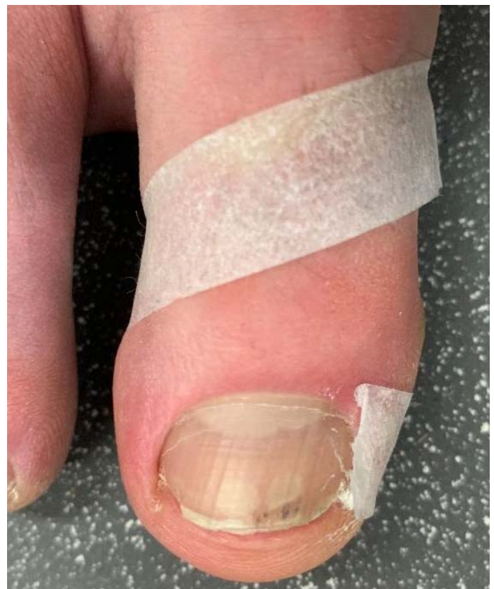
Figure 4. Illustration of the basic taping procedure using medical tape to treat onychocryptosis of the right first toenail. The tape is placed on the medial aspect of the lateral nail fold and pulled in an oblique and proximal direction around the toe dorsally, separating the nail fold from the intruding nail plate.

Multiple taping methods exist, with the goal of separating the nail fold from the offending nail edge [24]. The most basic taping method involves daily application of a strip of tape, pulling the offending nail fold away from the nail plate in oblique and proximal directions while preventing circulation constriction ( Figure 4 ). Additional securing may be required owing to moisture, use of cyanoacrylate adhesive, acetone, mastisol, and a second anchoring tape have all been described [10, 25, 26]. An elegant variation is the “split tape-strap procedure” in which the nail is positioned between an adhesive with a midline slit and the tape pulled toward the plantar surface to separate the nail fold from the nail edge