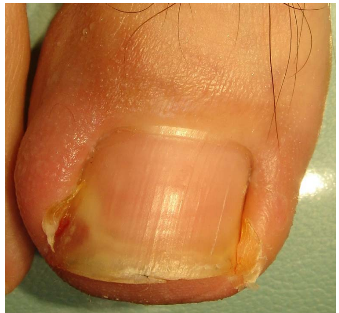
Figure 2. Stage II onychocryptosis of the left first toenail. Note the Stage I features (edema, erythema) coupled with ulceration of the lateral nail fold.

Severe (Stage III) - chronic inflammation with formation of epithelialized granulation tissue with marked nail fold hypertrophy ( Figure 3 ).