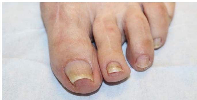
Figure 1. Onychocryptosis of the left first toenail in an 80-year-old woman. The lateral aspect of the nail plate is penetrating the periungual dermis of the lateral nail fold.

When evaluating onychocryptosis, patients are questioned about chronology, prior trauma, footwear, occupation, sports activities, and hobbies.