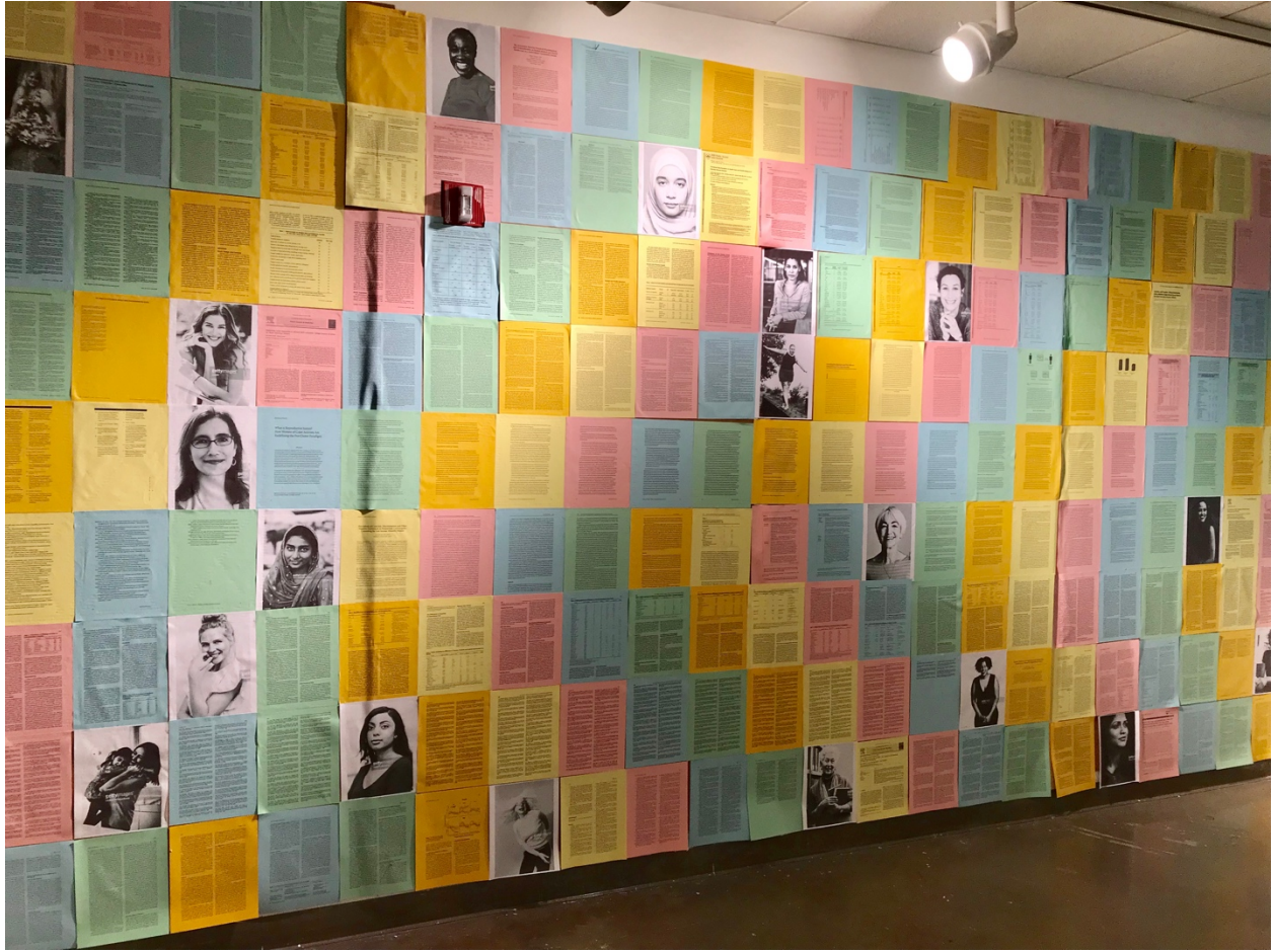
Figure 6. Cadegan, E. S. (2018). Research Wall One . [Print Media], Riverside: Phyllis Gill Gallery.