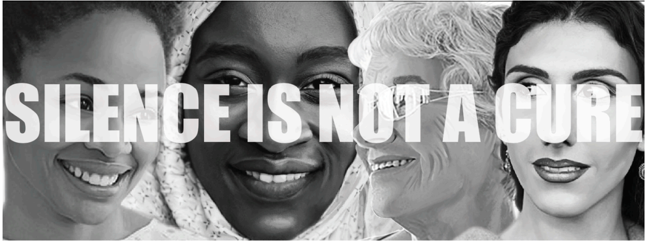
Figure 8. Cadegan, E. S. (2018). Silence is Not a Cure . [Digital painting print], Riverside: Phyllis Gill Gallery.