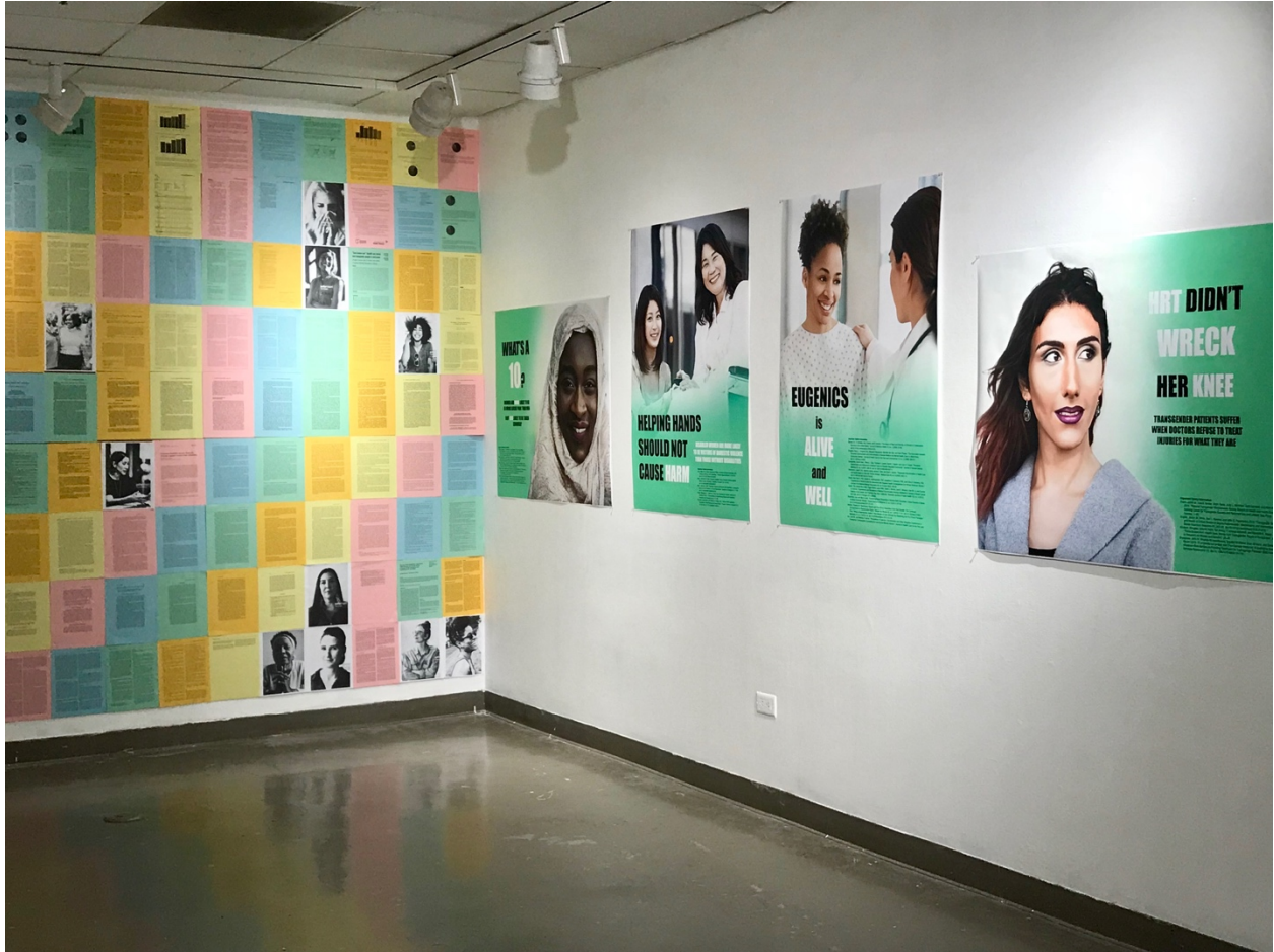
Figure 9. Installation view of Silence is Not a Cure (2018). Riverside: Phyllis Gill Gallery.