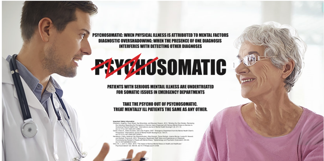
Figure 5. Cadegan, E. S. (2018). Psycho//Somatic . [Digital painting print], Riverside: Phyllis Gill Gallery.