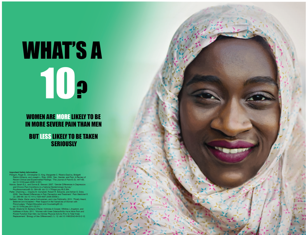
Figure 1. Cadegan, E. S. (2018). What's a 10? . [Digital painting print], Riverside: Phyllis Gill Gallery.