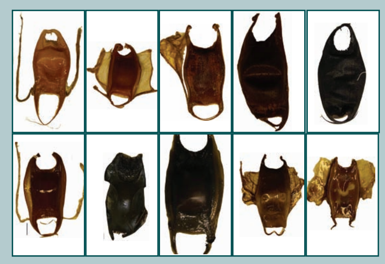
Egg cases of California skates. It is possible to speciate skates via their egg cases.