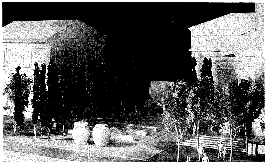
Proposal by Martin Puryear and Michael Van Valkenburgh.