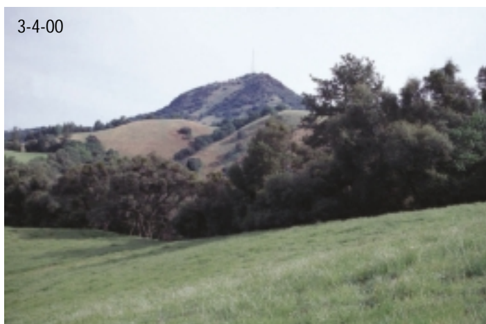
Figure 1. Annual landscape photos taken in early March (no photo is available for 1998).