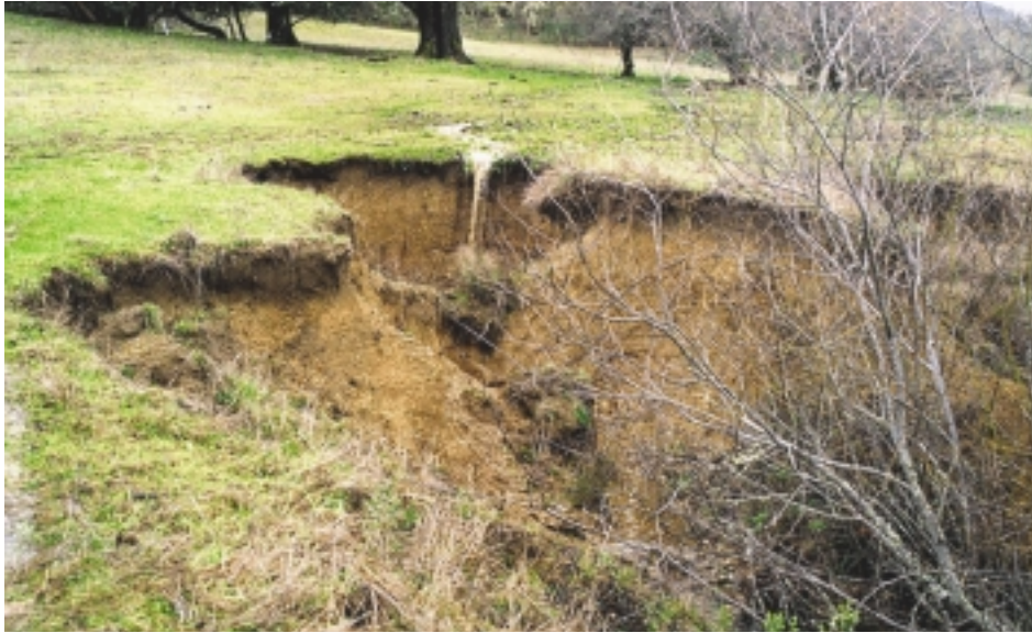
Figure 5. “Before and after” photographs to show the effect of a practice.