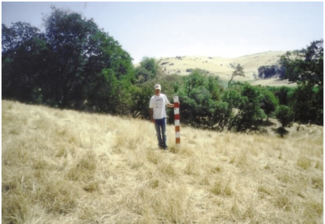
Figure 7. You can use a profile board to indicate scale in a photograph.

Take as many photos as necessary to adequately document landscape conditions. For example, you may need to take upstream, downstream, and across-stream photos in order to thoroughly document riparian conditions along a stretch of a stream. Within each picture, include a photo ID card to record the date and photo point number. Be sure the writing is large and legible. An 8.5 × 11 inch sheet of paper with large, thick writing from a felt-tip pen should be adequate. Some cameras are equipped with a date stamp, which simplifies record keeping. To provide scale in photographs, especially close-ups, you may want to include a profile board (Figure 7) or other object of a known size in the picture. Any object with delineated measurements that will be visible in a photograph is adequate. If you place another permanent marker such as a steel post or a length of rebar where the profile board appears, it will be easier for you to put the profile board in the same position the next time you take pictures. Alternatively, you could place the profile board a known distance in a known direction from the photo point.