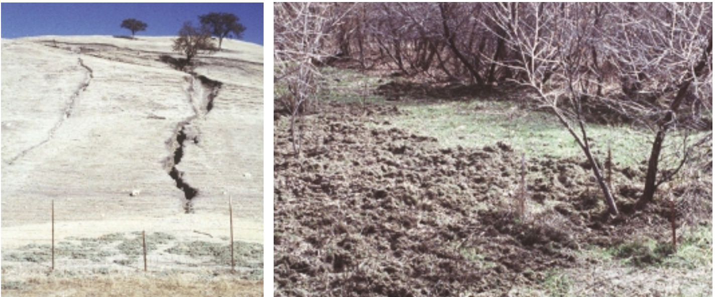
Figure 4. Photos taken to document events (gully formation and rooting by feral pigs).

Event photos can be used to document unplanned or unusual events such as fires, floods, erosion, wildlife damage, and vandalism (Figure 4), and practice photos can be used to document management practices (Figure 5). You can use “before and after” photos to document the implementation and effectiveness of practices, the effects of fire and post-fire recovery, the invasion and control of weeds and shrubs, and other long-term changes.