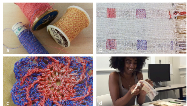
Figure 1: a) Ebb consists of conductive thread coated with thermochromic paint. b, c) We created several swatches showcasing color-changing effects using weaving and crochet techniques. d) We invited fashion designers and non-designers to see and feel the swatches in order to ground a conversation about potential meanings of color-changing textiles in their design practice or personal style.

In order to probe these meanings, we developed a novel textile display technology, called Ebb , and asked fashion designers and non-designers to describe how they might (or might not) integrate it into their practice or personal style (Figure 1). Ebb emerged from creative and technical collaboration with Google Jacquard [19,41], which was developing materials for weaving electrical conductivity into textiles at scale. The core technology of Ebb consists of conductive threads individually coated with thermochromic