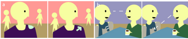
Figure 5: Envisioned uses of Ebb. Participants described various ways that abstract displays of information (circles and stripes as opposed to arrows or numbers) could be strategically engaged in social scenarios.

progressed, it would move in an arc to his right side. The change would be too slow to be noticed immediately but could be discovered by people who interacted with him over the course of a day. Specifically, he imagined friends looking at his Facebook feed and discovering that his shirt had been changing in a way they had not been aware of.