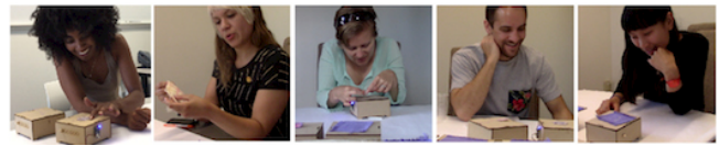
Figure 4: Fashion designers and wearers engaged with Ebb and discussed how they envisioned it within their style.

Throughout the sessions, we allowed participants to talk at length about aspects of Ebb they found personally interesting or uninteresting. To provoke discussions on topics that the participant found personally important, we based many questions on the unique responses of the participants. All sessions were video recorded and later transcribed for analysis. We analyzed video and transcripts using a grounded theory approach [7] in order to reveal common associations and themes that shaped perceptions and envisioned uses of Ebb. Audio from each interview